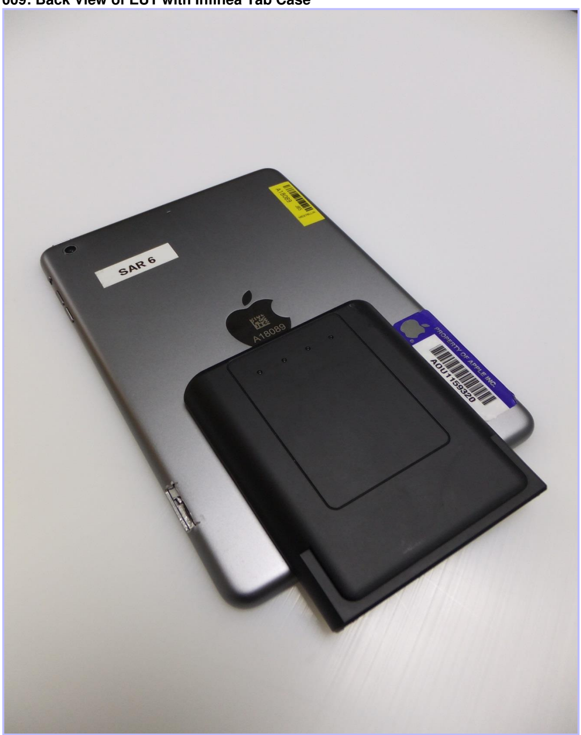
009: Back View of EUT with Infinea Tab Case