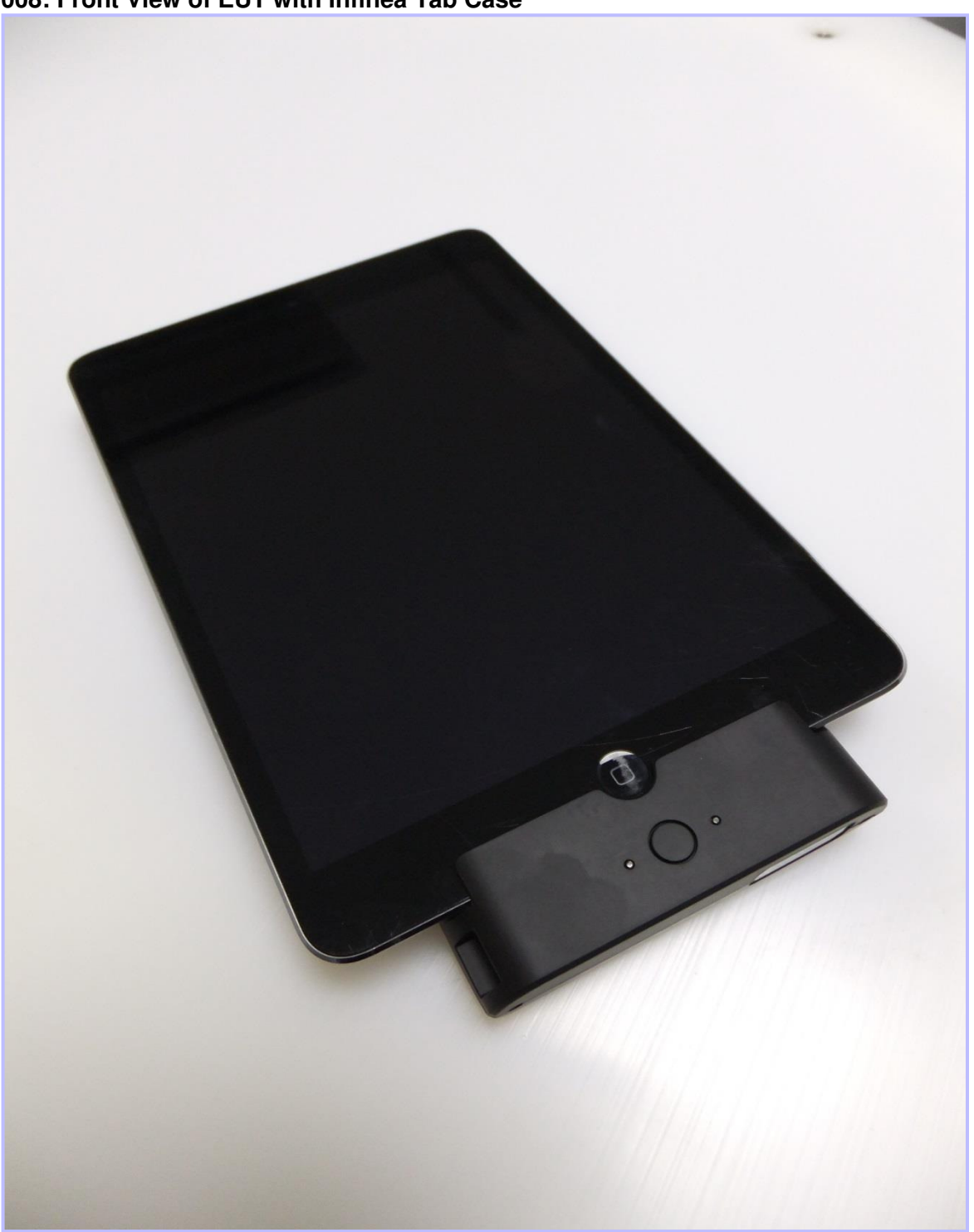
008: Front View of EUT with Infinea Tab Case