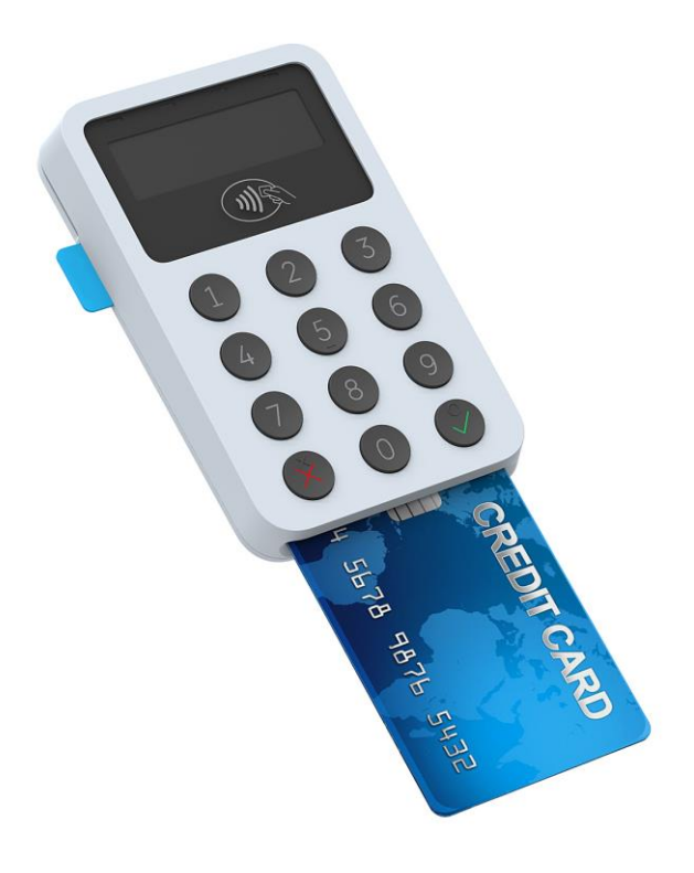
Figure 6 Smart card with the gold contacts upward