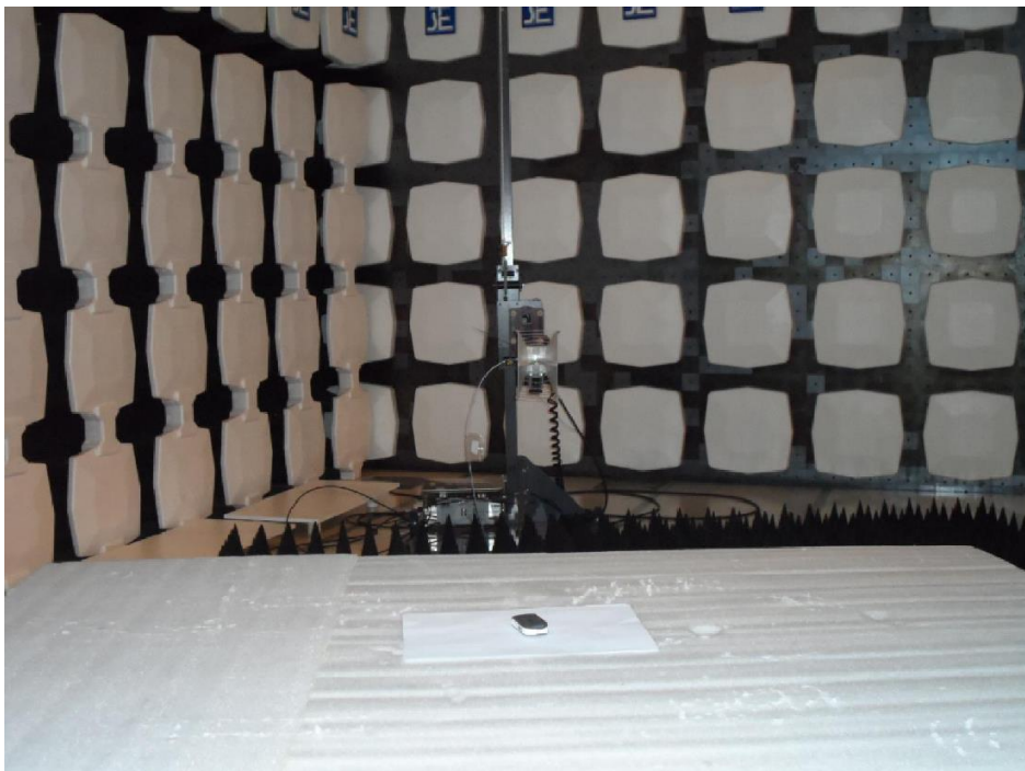
tested frequency > 1000 MHz