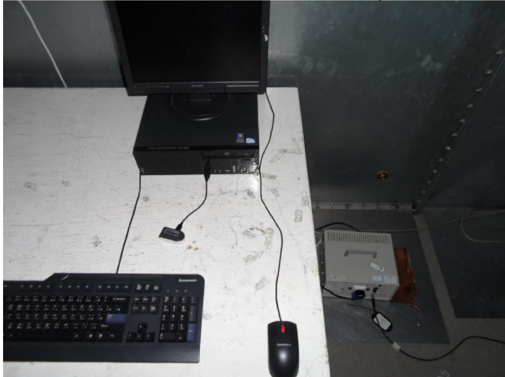
Measurement of Conducted Emission Test Set Up