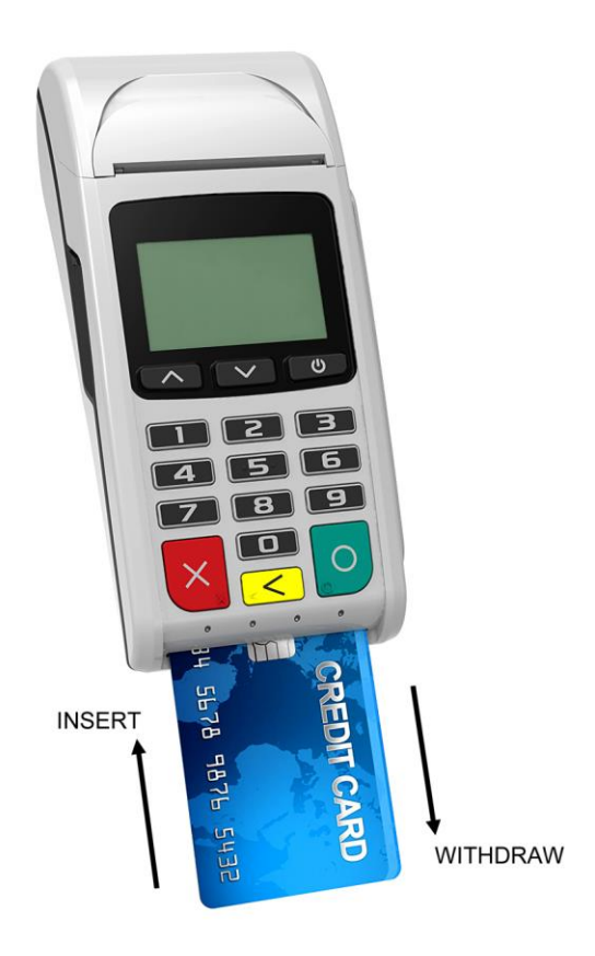
Figure 6 Smart card with the gold contacts upward