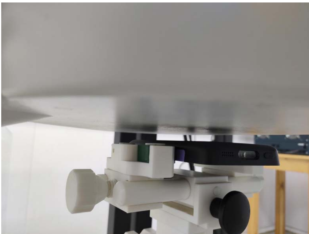
10mm body-worn Right Side Setup Photo (hotspot)