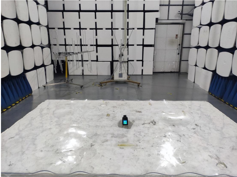
Fig. 1 (Below 1GHz)