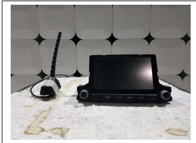
EUT Position: Y-axis