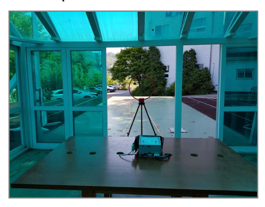
Photo of radiated spurious emission at 30 \text{MHz} \sim 1~000 \text{MHz}

Photo of radiated spurious emission at below 30MHz