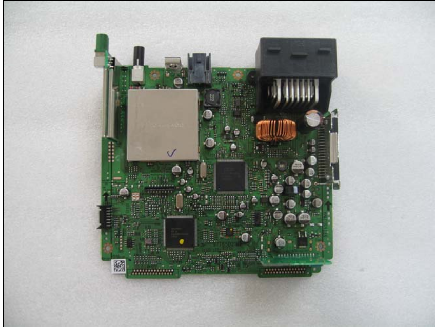
Bottom view of Main PCB