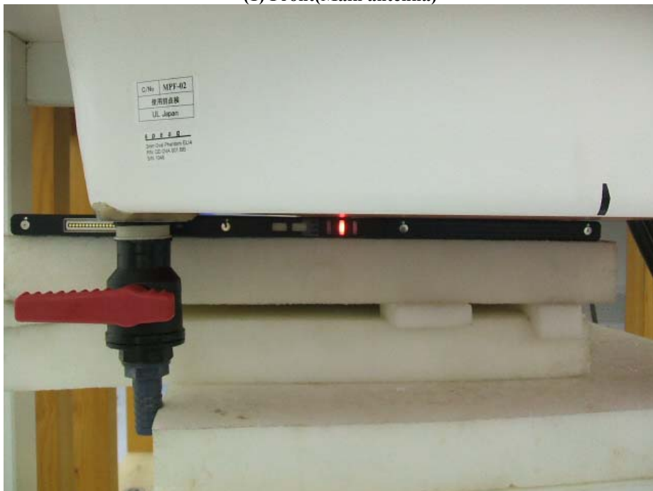
(1) Front(Main antenna)