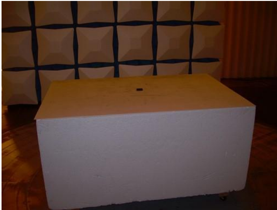
Photograph 1: Front View Radiated Emissions, Below 1000 MHz Worst Case (FLAT) Configuration