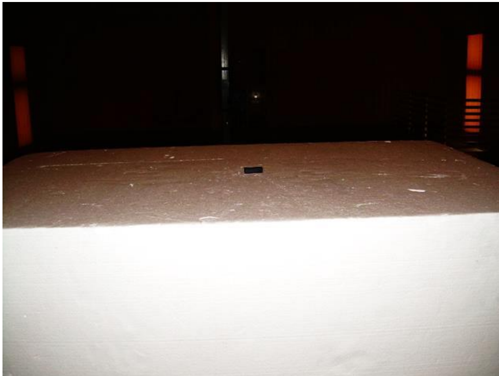
Photograph 4: Back View Radiated Emissions Worst Case – Above 1000 MHz Configuration