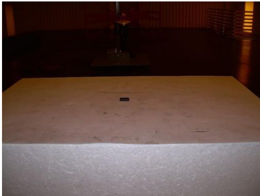
Photograph 2: Back View Radiated Emissions, Below 1000 MHz Worst Case Configuration