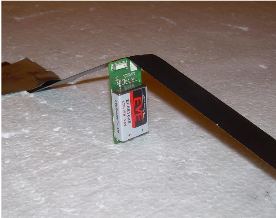
Photograph 5: Radiated Emissions Vertical Placement