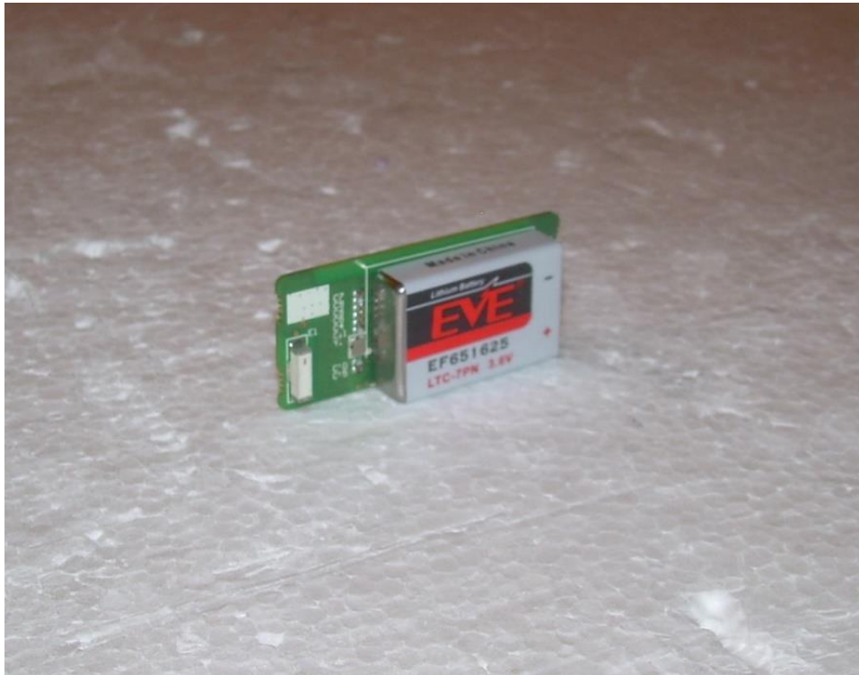
Photograph 6: Radiated Emissions Edge Placement