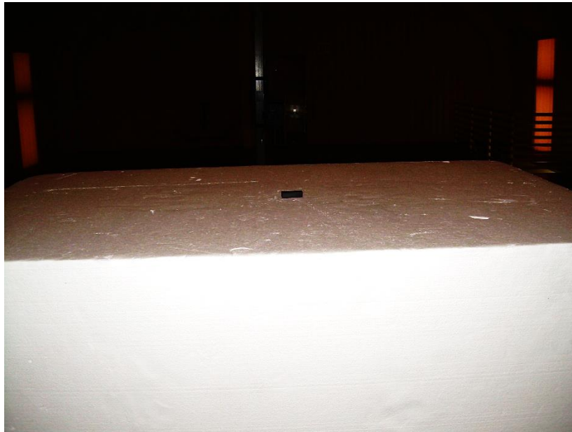
Photograph 6: Back View Radiated Emissions – Above 1000 MHz