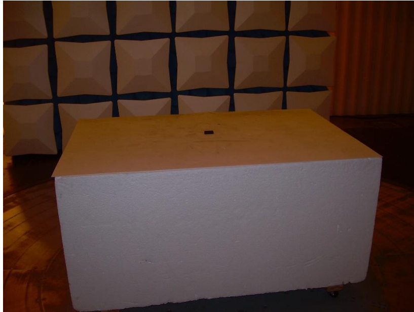
Photograph 1: Front View Radiated Emissions – Below 1000 MHz – Flat Placement