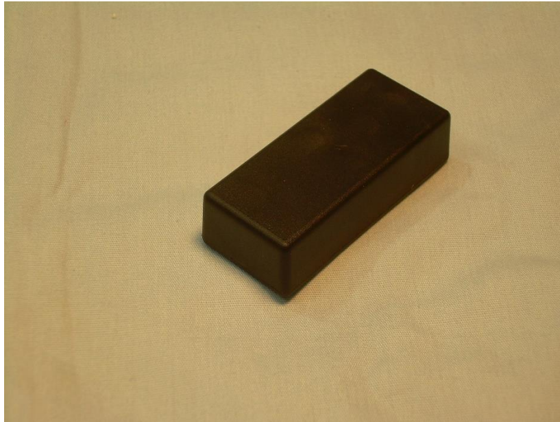
Photograph 7 - Front View of the EUT