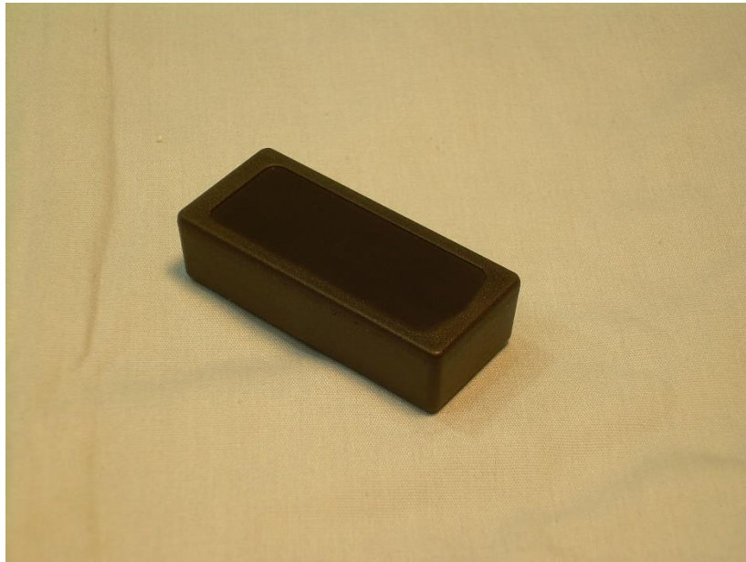
Photograph 8 - Back View of the EUT