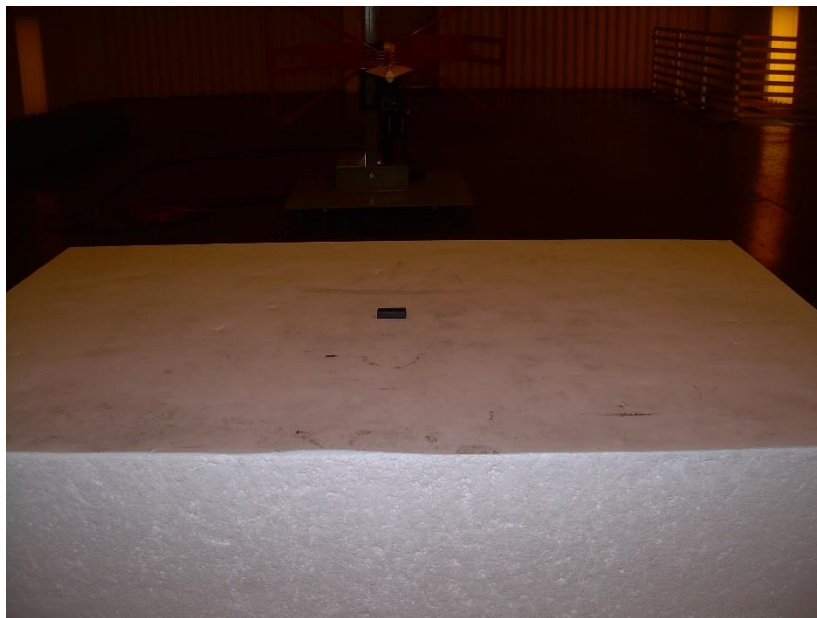
Photograph 2: Back View Radiated Emissions 30 MHz to 1000 MHz – Flat Placement