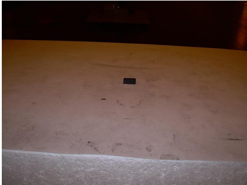
Photograph 3 – View Conducted Emissions On Edge Placement