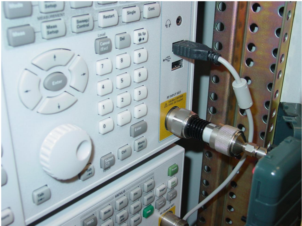
RF conducted measurements