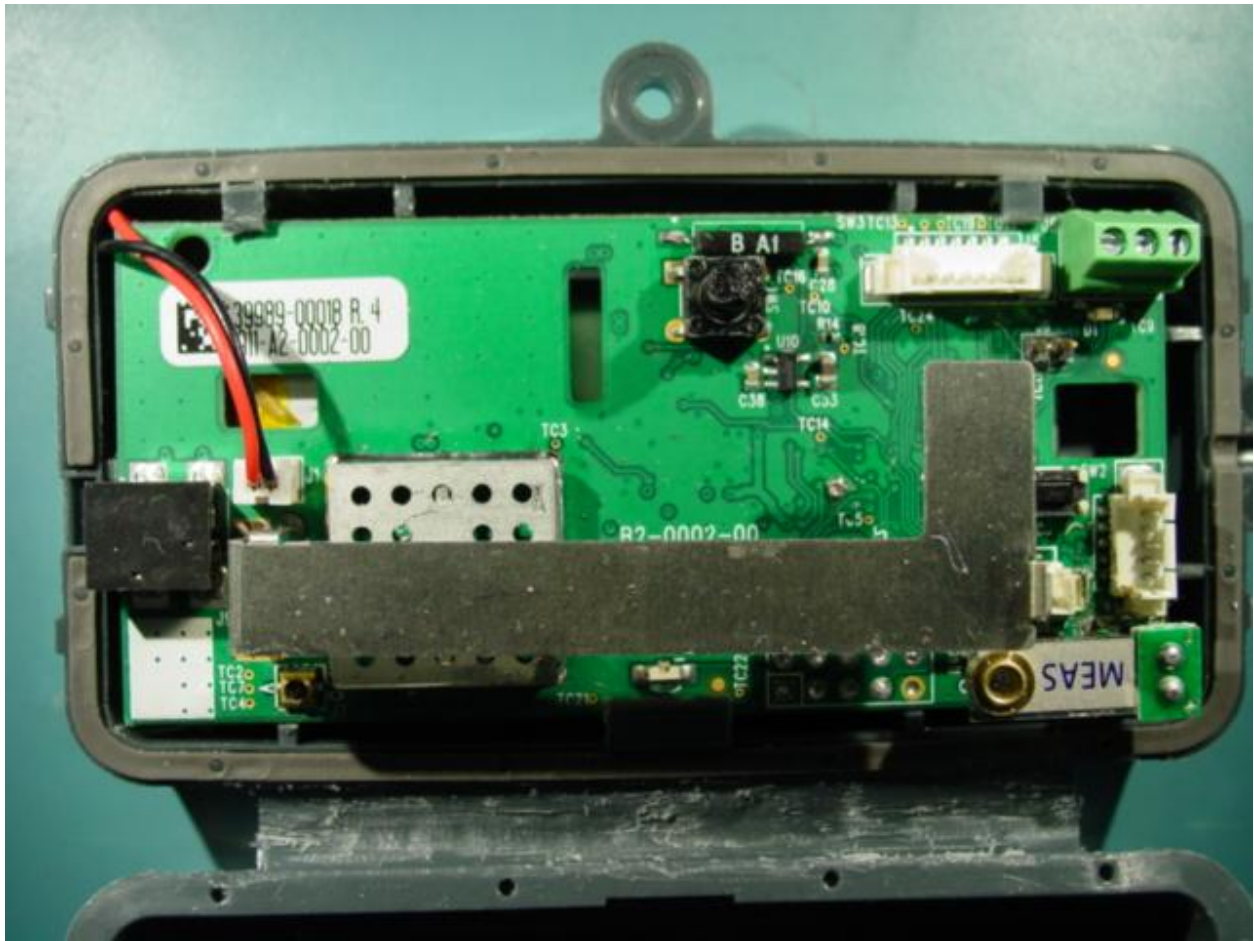
Circuit board top with shield and antenna in plastic case