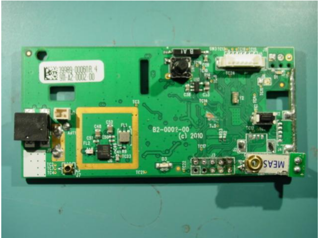
Circuit board top with out shield and antenna