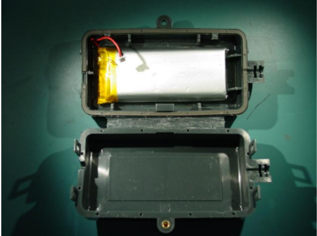
Internal case with battery installed