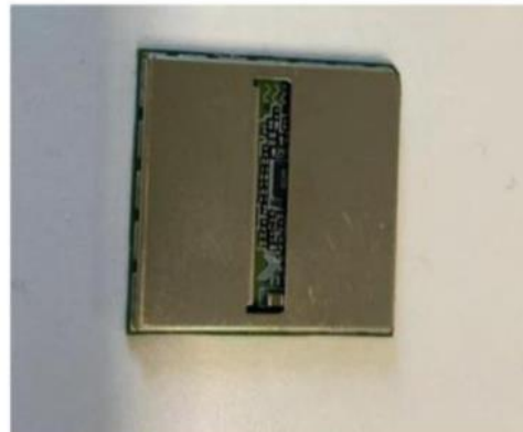
Figure 2. the module shielding Frame after