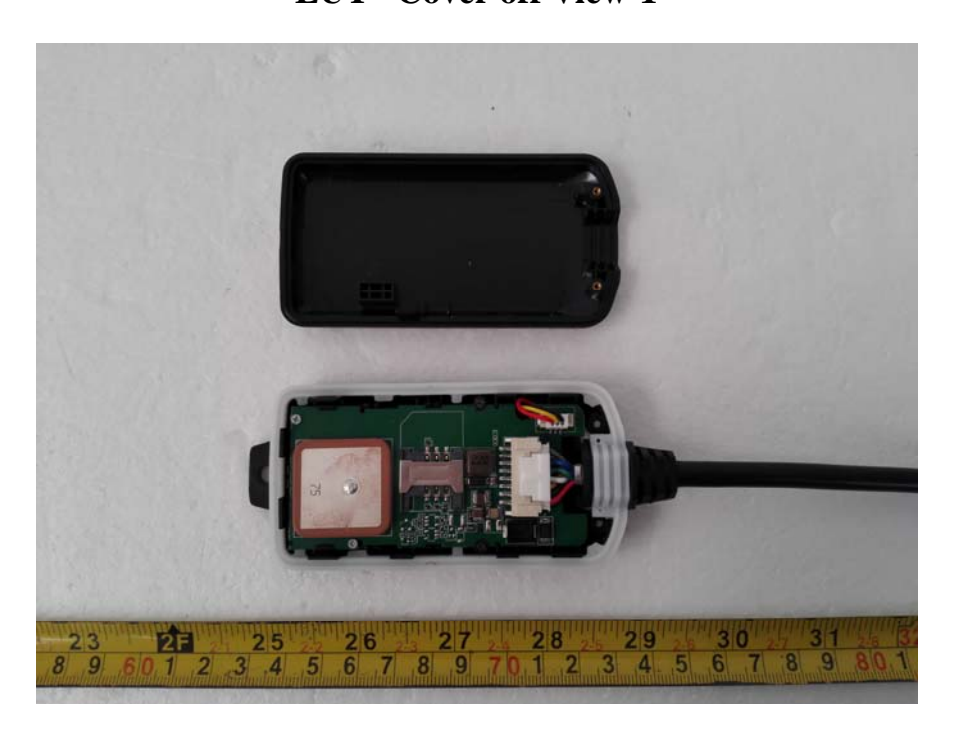
EUT –Cover off View -2