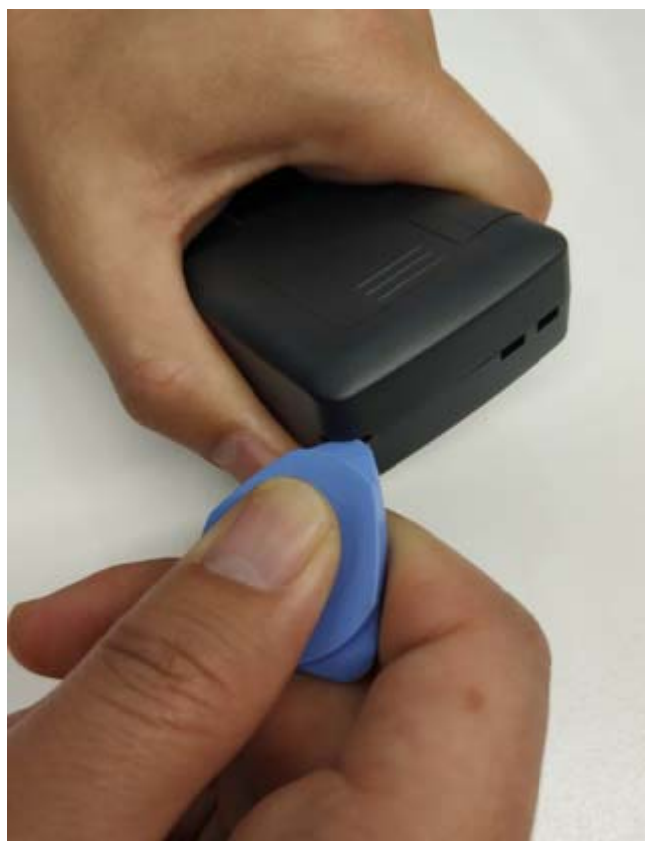
Figure 3. Opening the Case

Insert the triangular-pry-opener into the gap of the case as shown below, push the opener up until the case unsnapped.