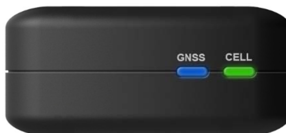
Figure 6. GV500MAP LED on the Case