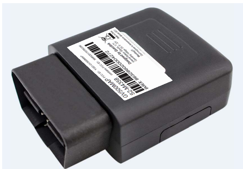
Figure 1. Appearance of GV500MAP

GV500MAP is based on the OBD II interface GNSS vehicle tracking device, compact design and easy to install. GV500MAP contains an 5PIN micro USB connector, an internal LTE antenna, two internal GNSS antennas and two LEDs.