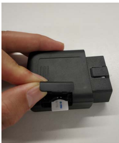
Figure 5. SIM Card Installation

Open the rubber plug and insert the SIM card into the holder as shown below.