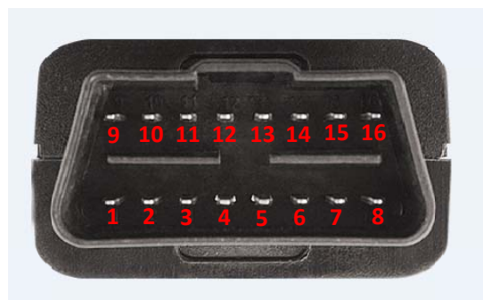
Figure 2. The OBD II connector on the GV500MAP

The GV500MAP has an OBD II connector. The sequence and definition of the OBD II connector are shown in following figure: