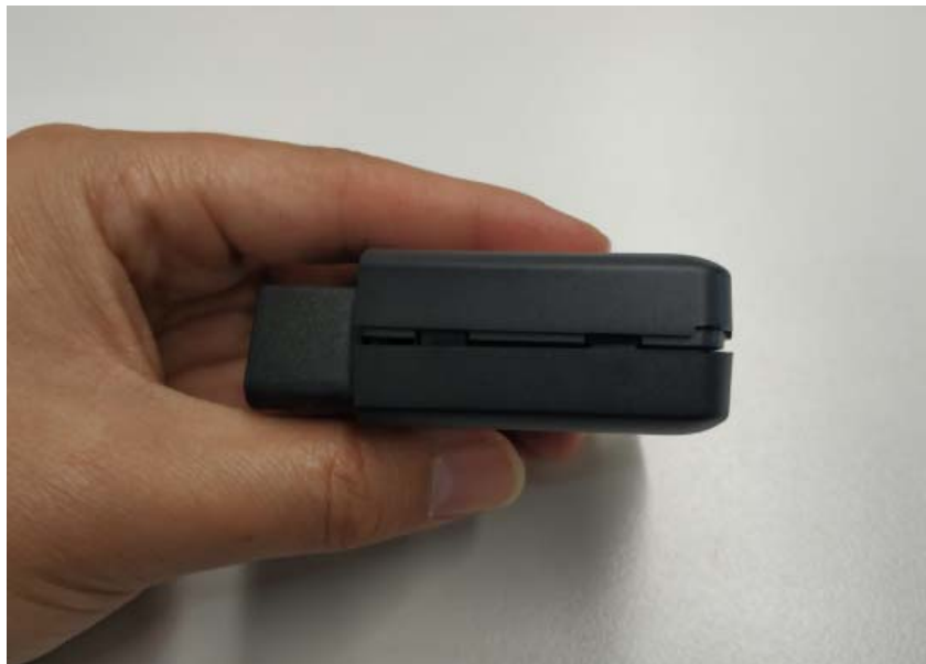
Figure 4. Closing the Case

The step of closing case is shown as following: