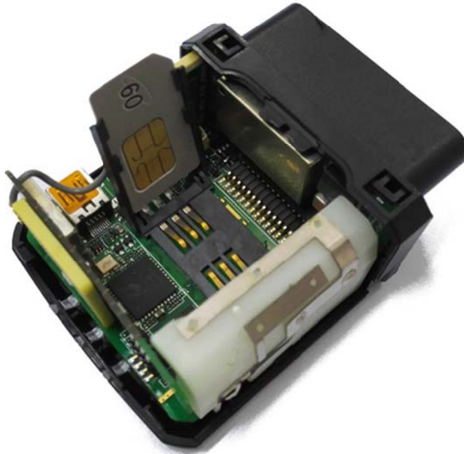
Figure 4. SIM Card Installation

Open the case and ensure the unit is not powered. Slide the holder right to open the SIM card. Insert the SIM card into the holder as shown below with the gold-colored contact area facing down taking care to align the cut mark. Close the SIM card holder. Close the case.