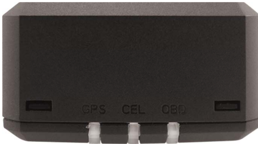
Figure 6. GV500 LED on the Case