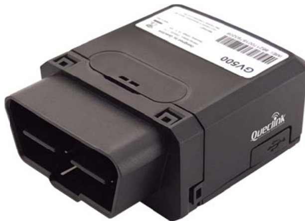
Figure 1. Appearance of GV500

GV500 is based on the OBD II interface GPS vehicle tracking device, compact design and easy to install. GV500 contains an OBD II connector which complies with J1962 standard, a 10PIN USB connector, an internal GSM antenna, an internal GPS antenna and three LEDs.