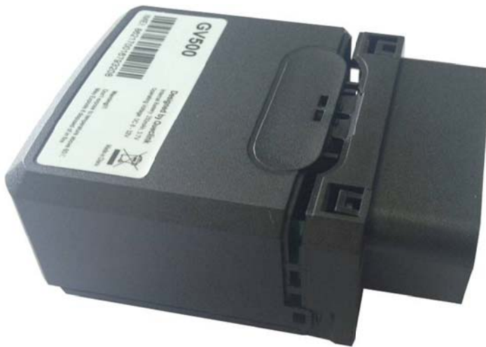
Figure 3. Opening the Case