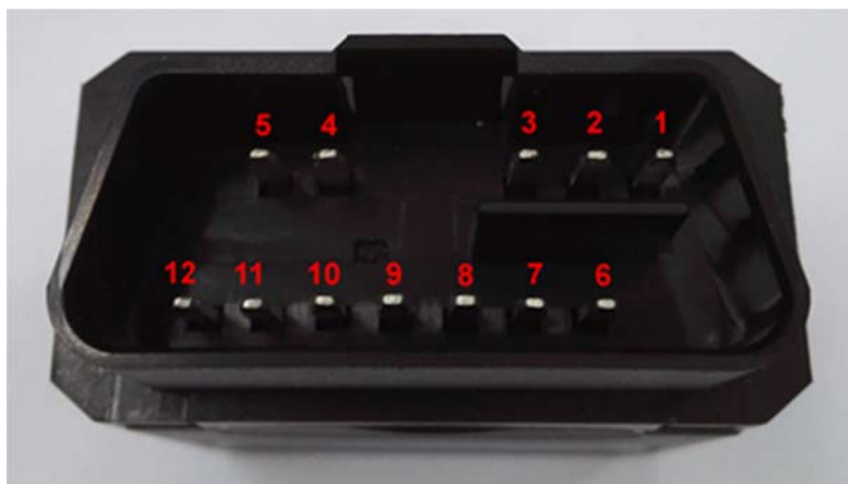
Figure 2. The OBD II connector on the GV500

The GV500 has an OBD II connector. It contains power supply and interfaces of CAN bus, K-line, L-line and J1850 bus. The sequence and definition of the OBD II connector are shown in following figure: