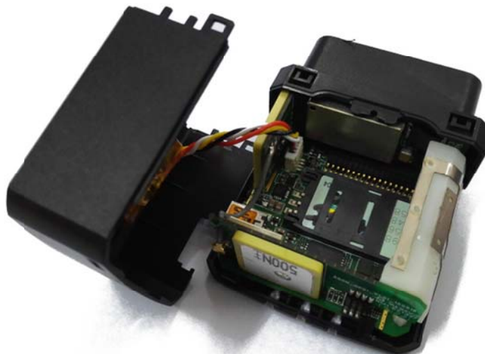
Figure 5. Backup Battery Installation

There is an internal backup Li-ion battery.