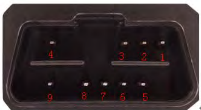
Figure 2. The OBD II connector on the GV500

The GV500 has an OBD II connector. It contains power supply and interfaces of CAN bus, K-line, L-line and J1850 bus. The sequence and definition of the OBD II connector are shown in following figure: