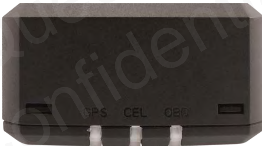
Figure 7. GV500 LED on the Case