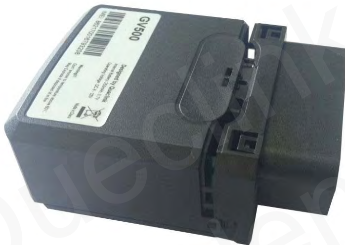
Figure 3. Opening the Case