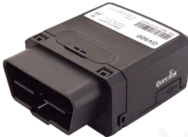
Figure 1. Appearance of GV500

GV500 is based on the OBD II interface GPS vehicle tracking device, compact design and easy to install. GV500 contains an OBD II connector which complies with J1962 standard, a 10PIN USB connector, an internal GSM antenna, an internal GPS antenna and three LEDs.