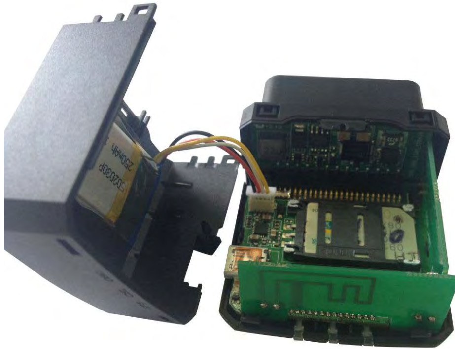
Figure 6. Backup Battery Installation

There is an internal backup Li-ion battery.