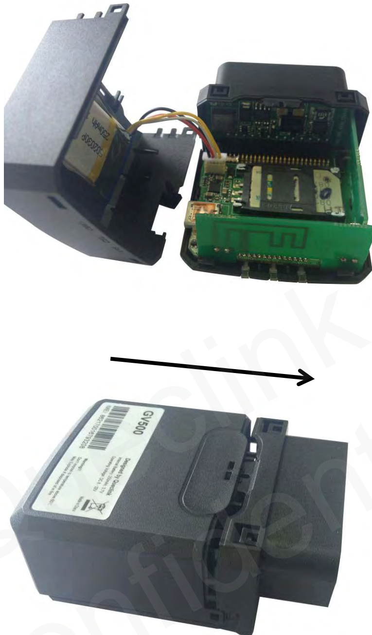
Figure 4. Closing the Case

The battery is glued to top cover, so before closing the case you should let the battery connector plugged in. The step of closing case is shown as following: