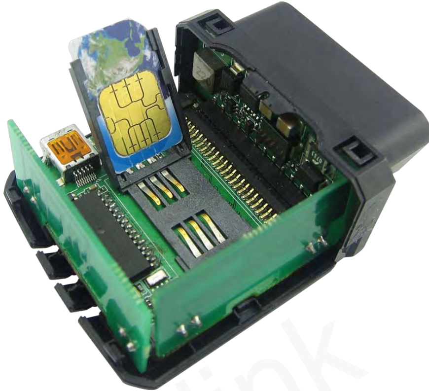
Figure 5. SIM Card Installation

Open the case and ensure the unit is not powered. Slide the holder right to open the SIM card. Insert the SIM card into the holder as shown below with the gold-colored contact area facing down taking care to align the cut mark. Close the SIM card holder. Close the case.