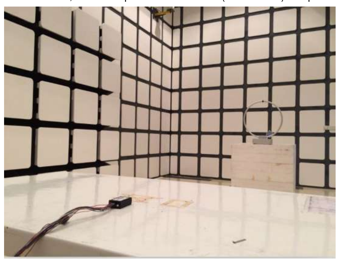
ERP Test, Radiated Spurious Measurement(30MHz to 1GHz) Setup

ERP Test, Radiated Spurious Measurement(Blow 30MHz) Setup