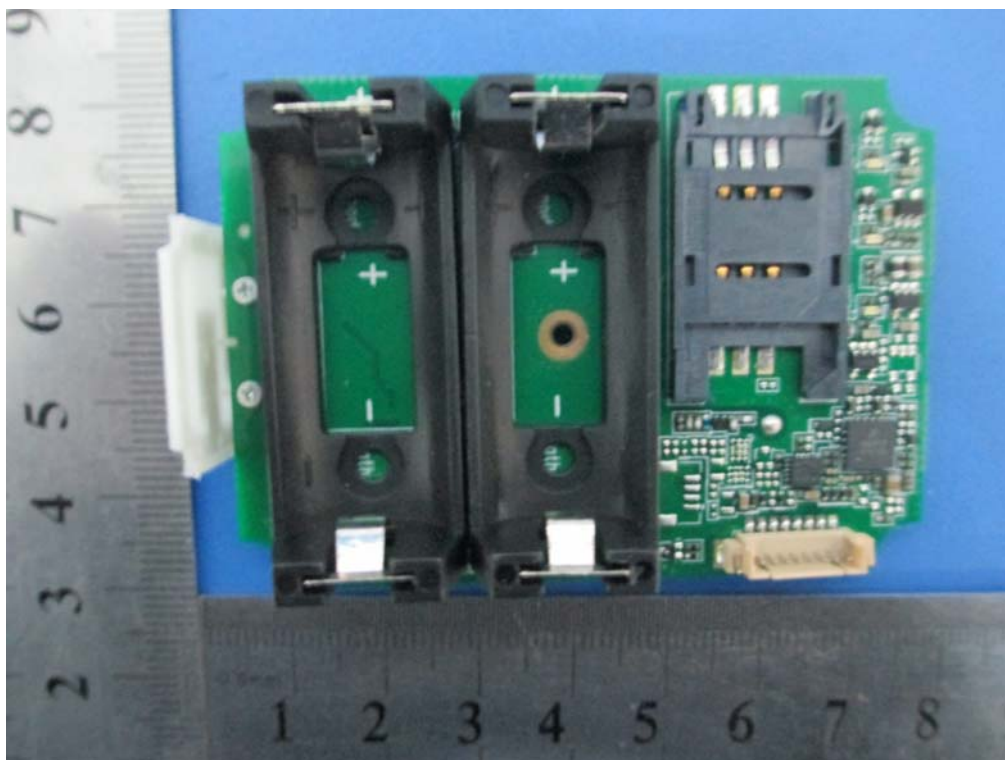
EUT – Main PCB Board Front View