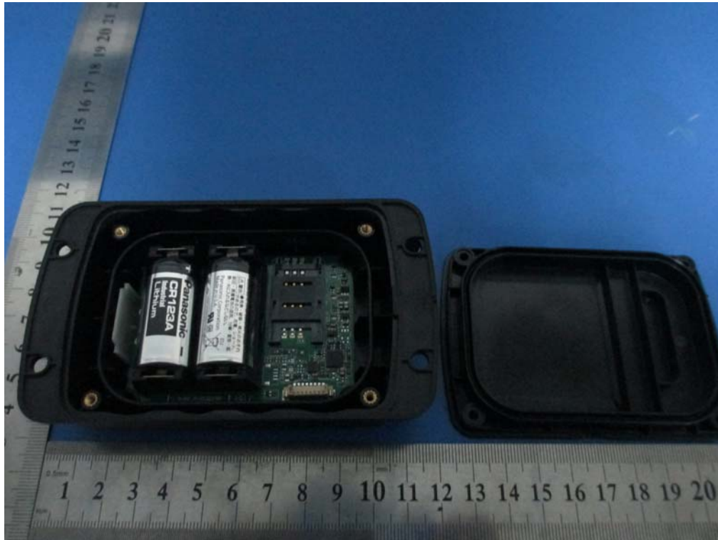
Cover Off - Top View1