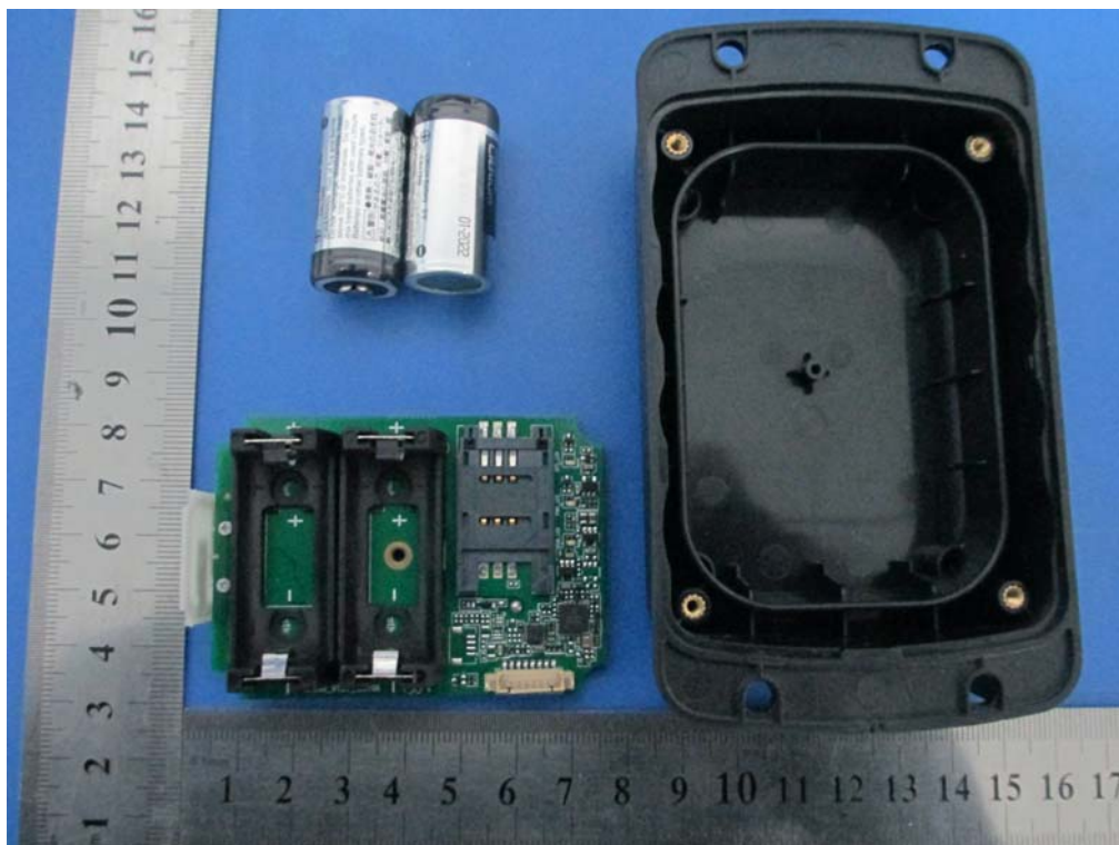
Cover Off - Top View2