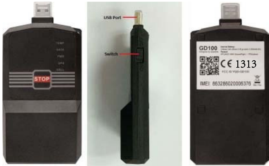
Figure 1. Appearance of GD100