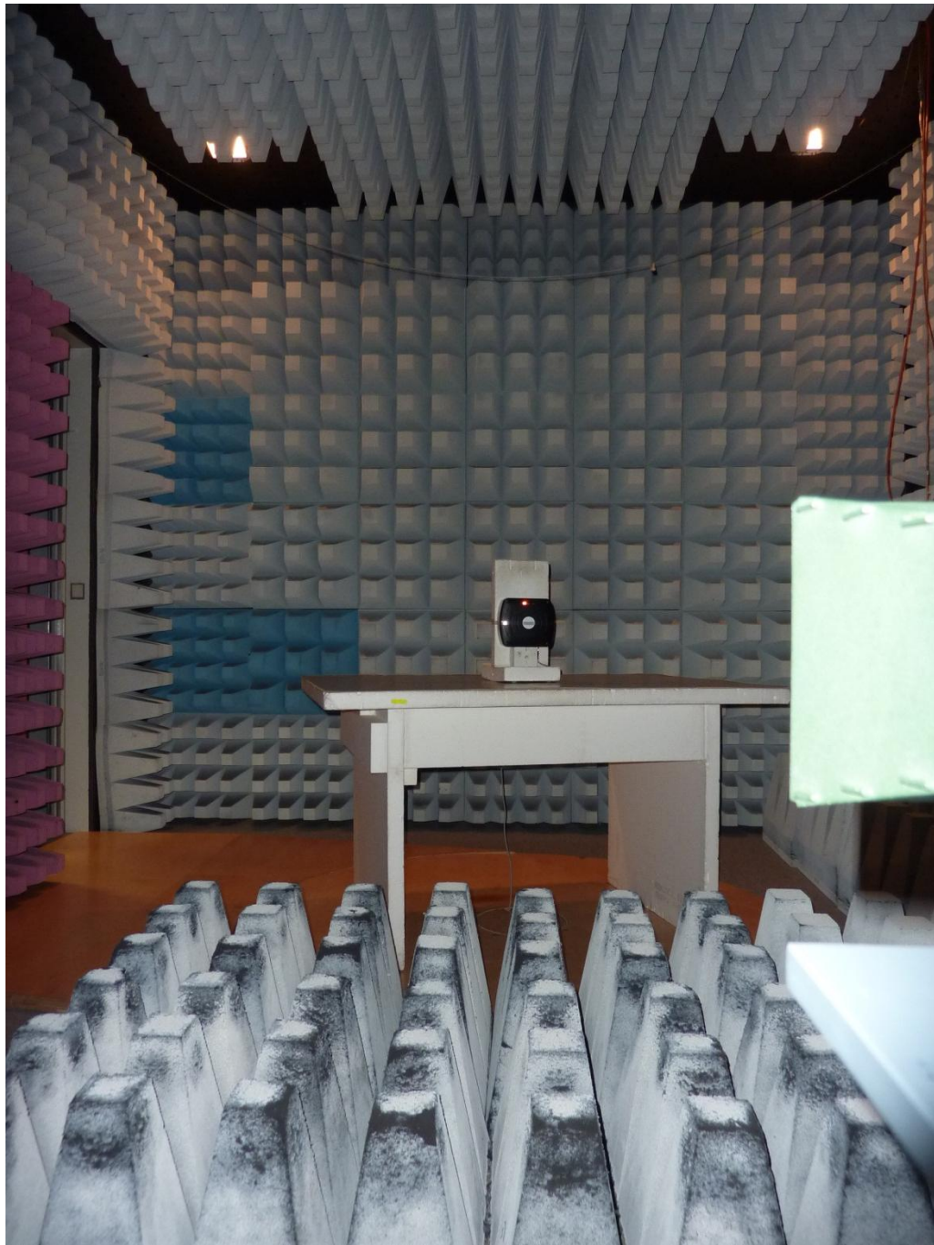
122887_20.JPG: TN902-Q175L200-H1147, test set-up fully anechoic chamber