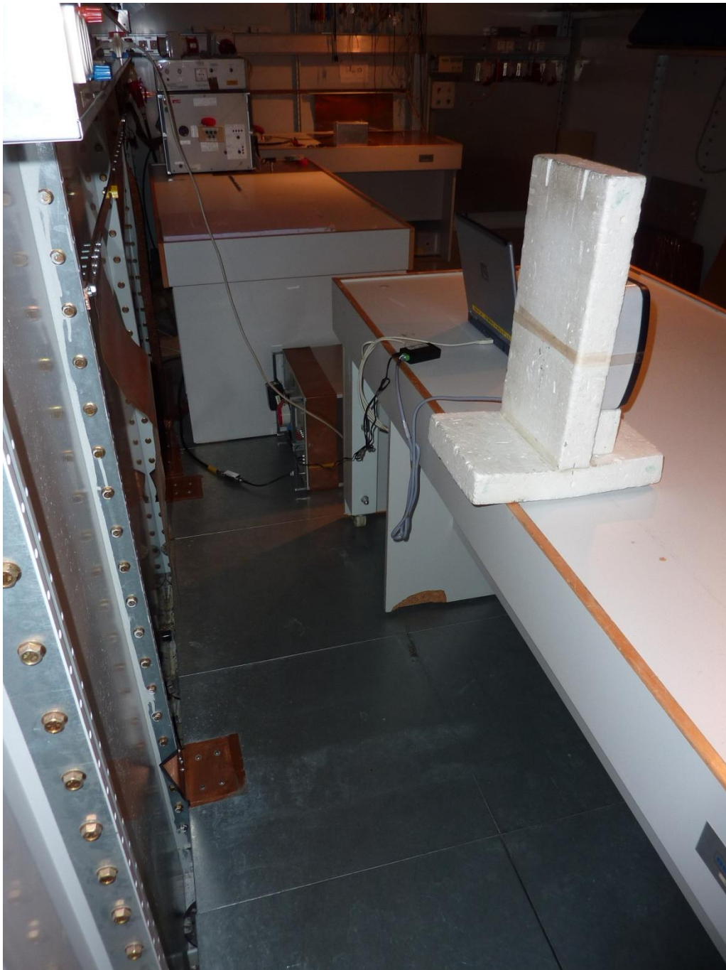
122887_22.JPG: TN902-Q175L200-H1147, test set-up shielded chamber