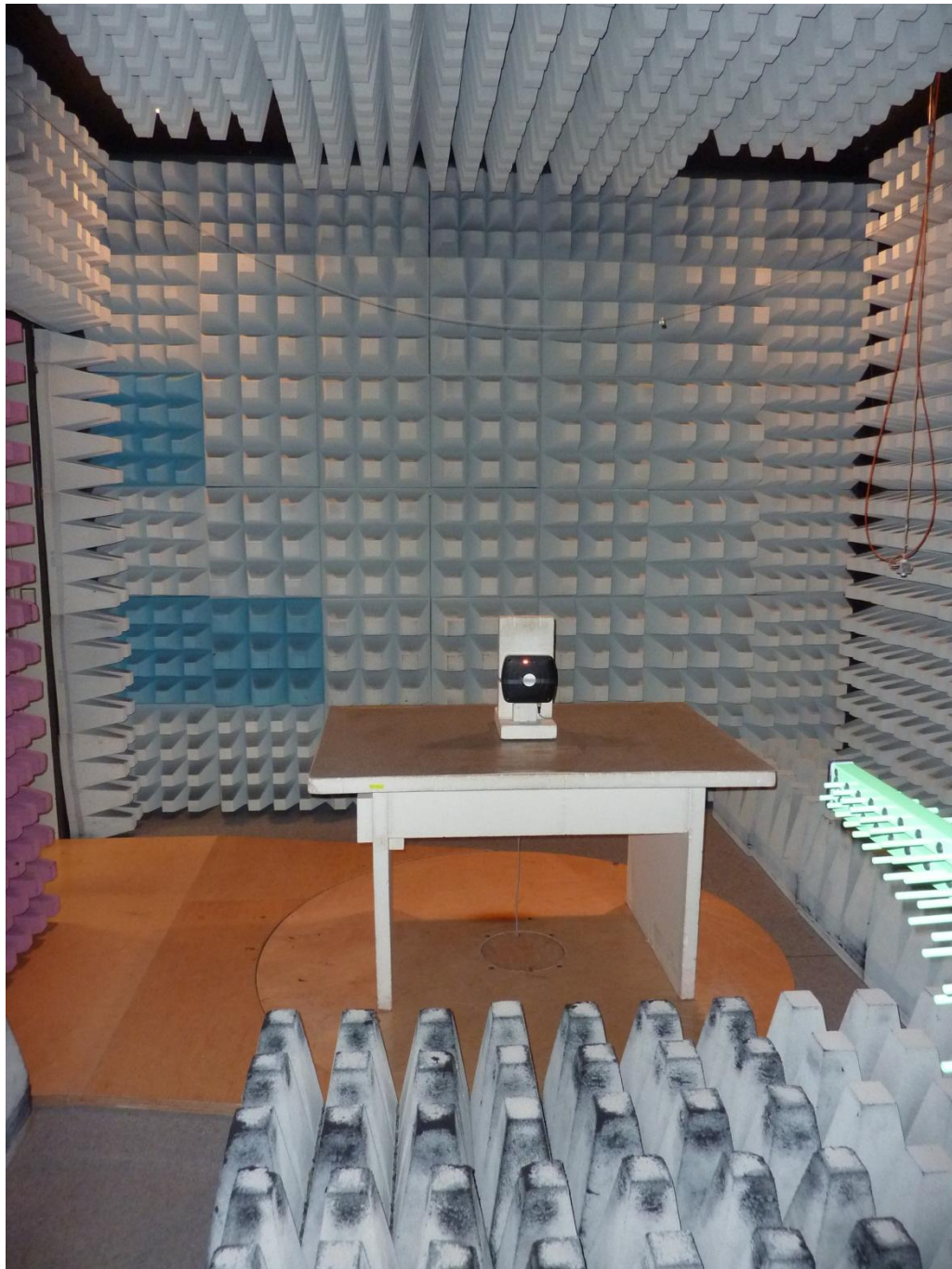
122887_21.JPG: TN902-Q175L200-H1147, test set-up fully anechoic chamber