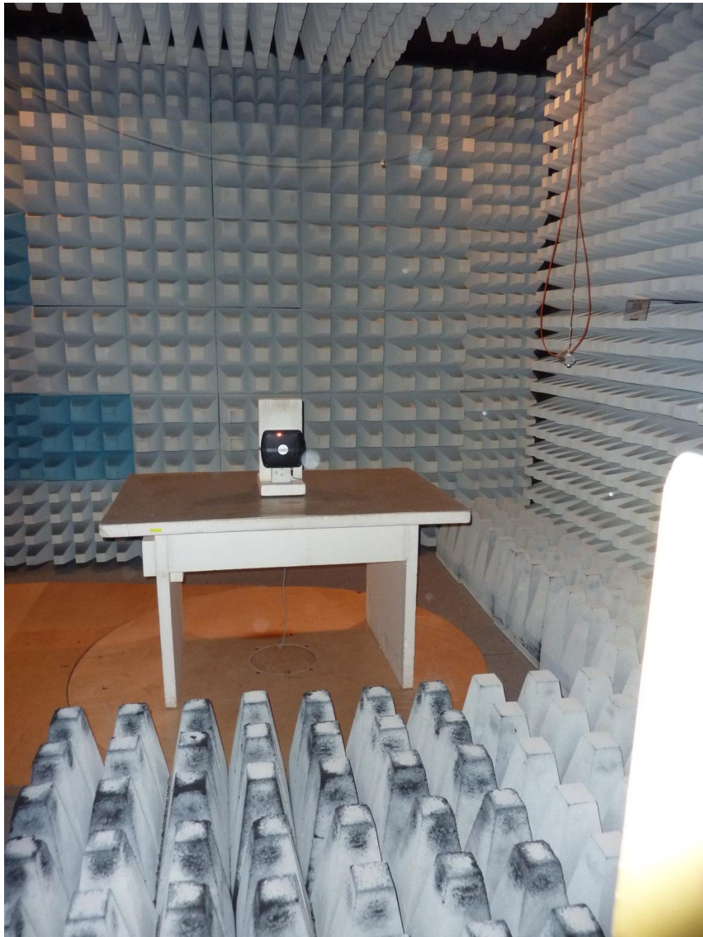
122887_19.JPG: TN902-Q175L200-H1147, test set-up fully anechoic chamber