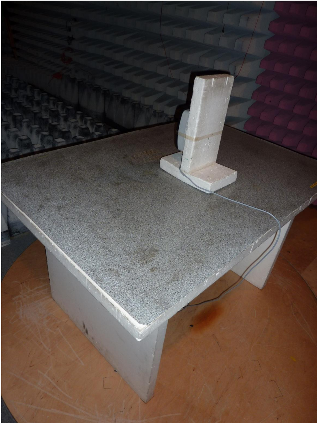
122887_17.JPG: TN902-Q175L200-H1147, test set-up fully anechoic chamber