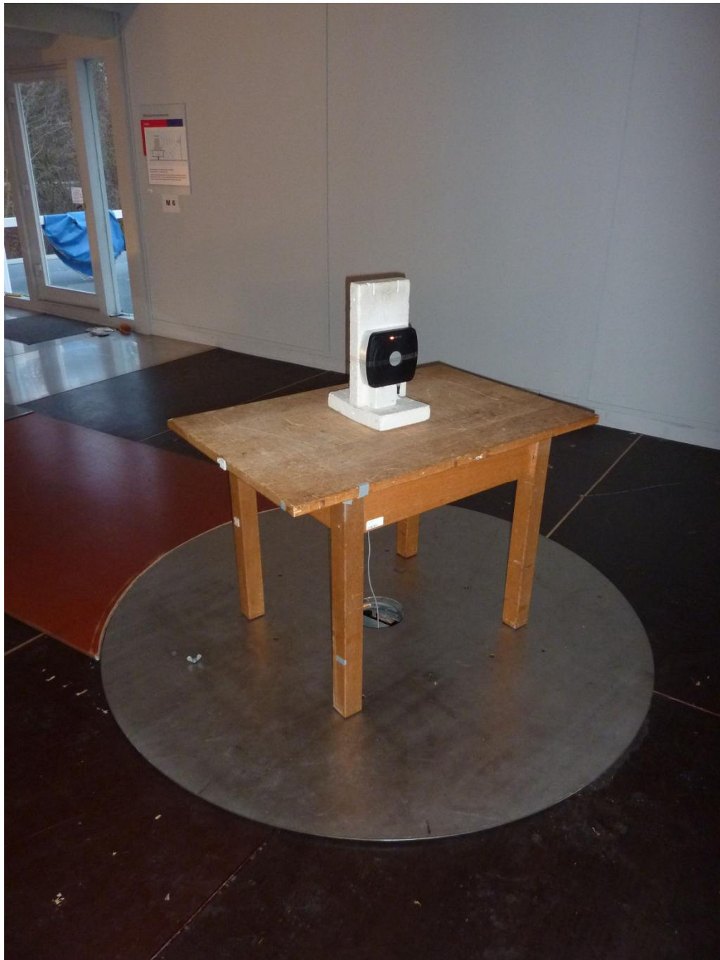
122887_18.JPG: TN902-Q175L200-H1147, test set-up open area test site