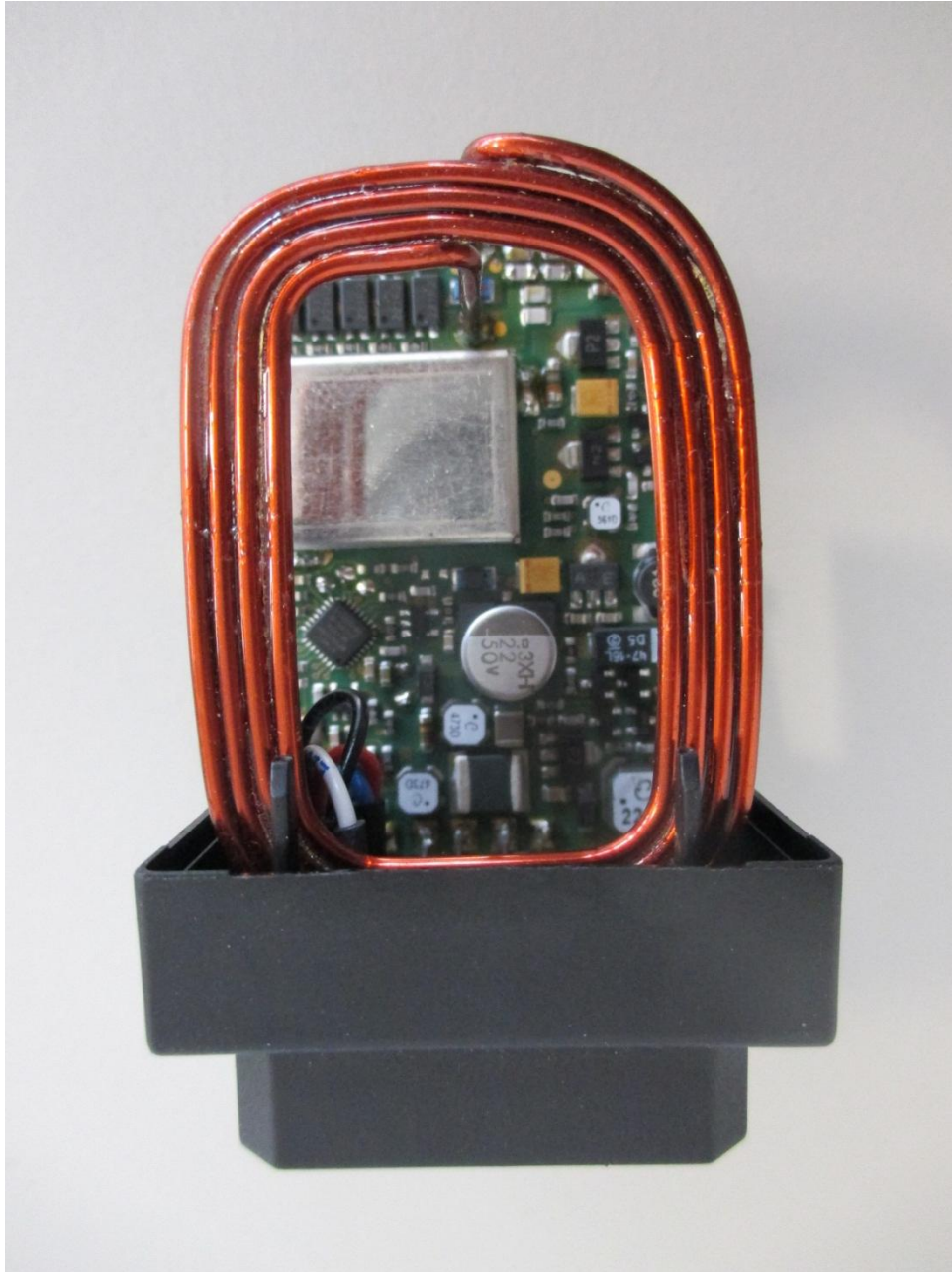
146179_9.JPG: TNSLR-Q42TWD-H1147, PCB top view