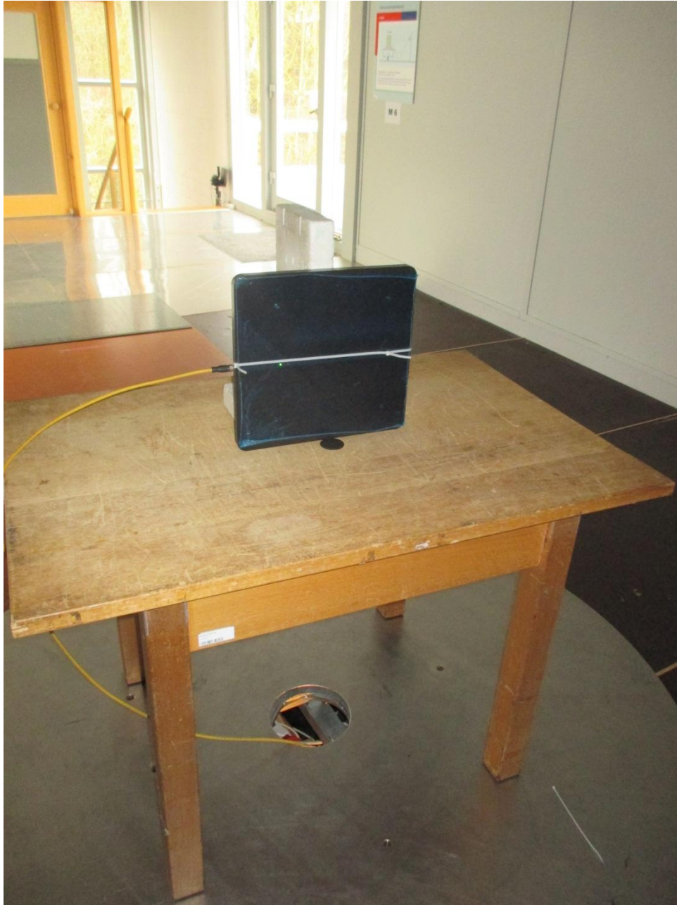
150243_4.JPG: Test setup open area test site