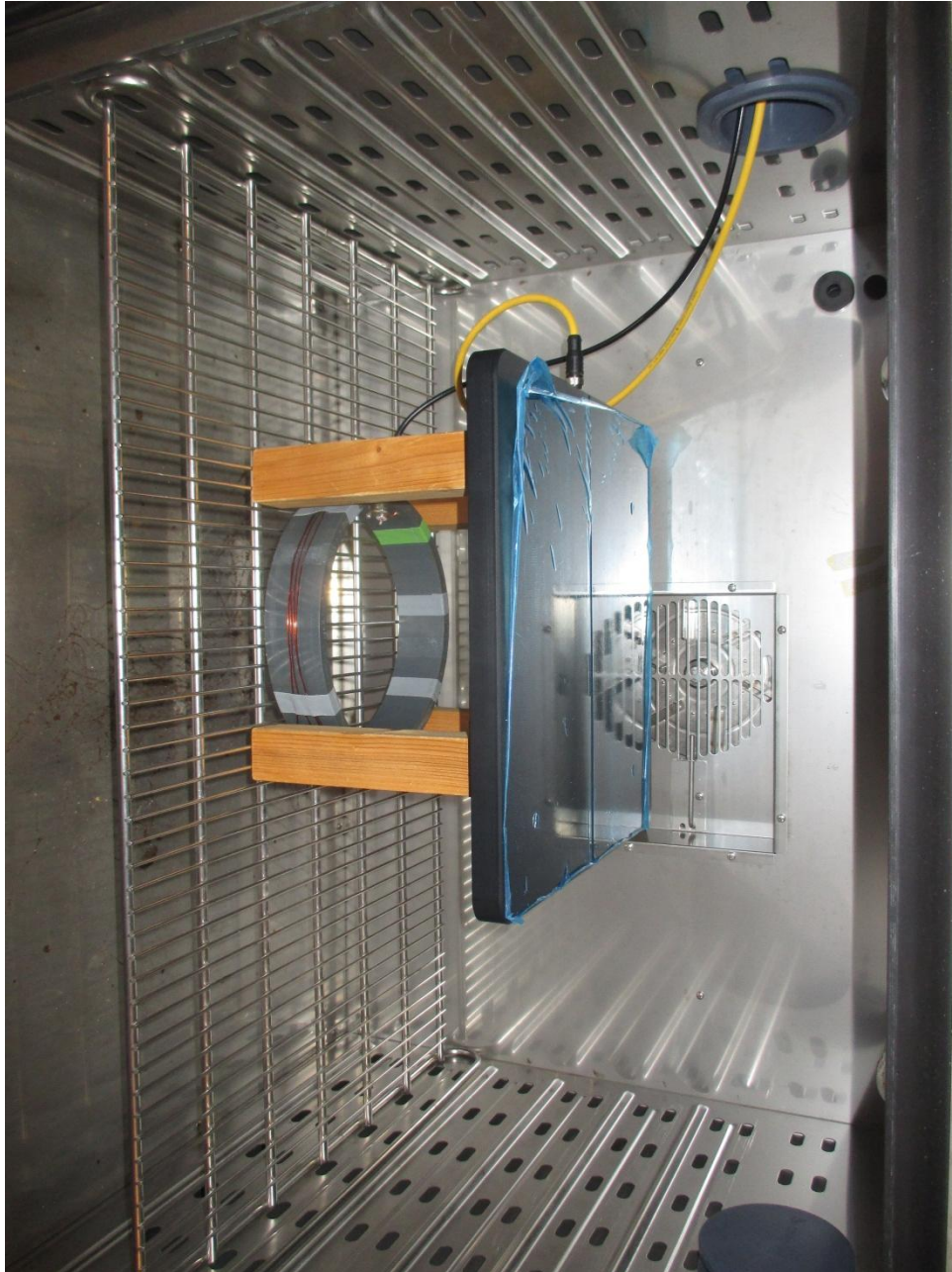
150243_6.JPG: Test setup temperature chamber