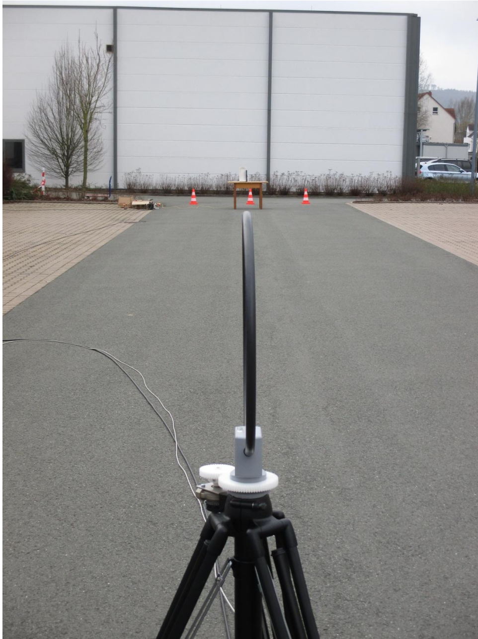
150243_5.JPG: Test setup outdoor test site