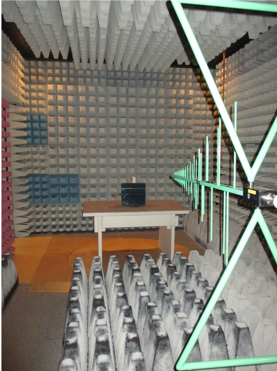
150243_2.JPG: Test setup fully anechoic chamber (E-Field)