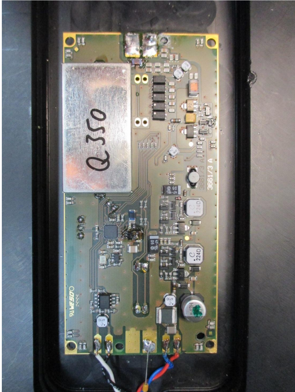
150243_12.JPG: TNSLR-Q350-H1147, PCB, bottom view