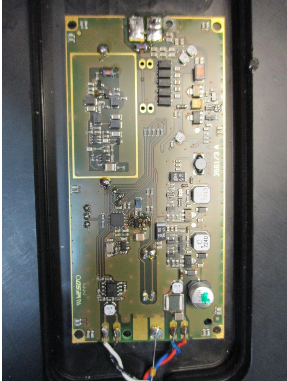
150243_13.JPG: TNSLR-Q350-H1147, PCB, bottom view, shielding removed