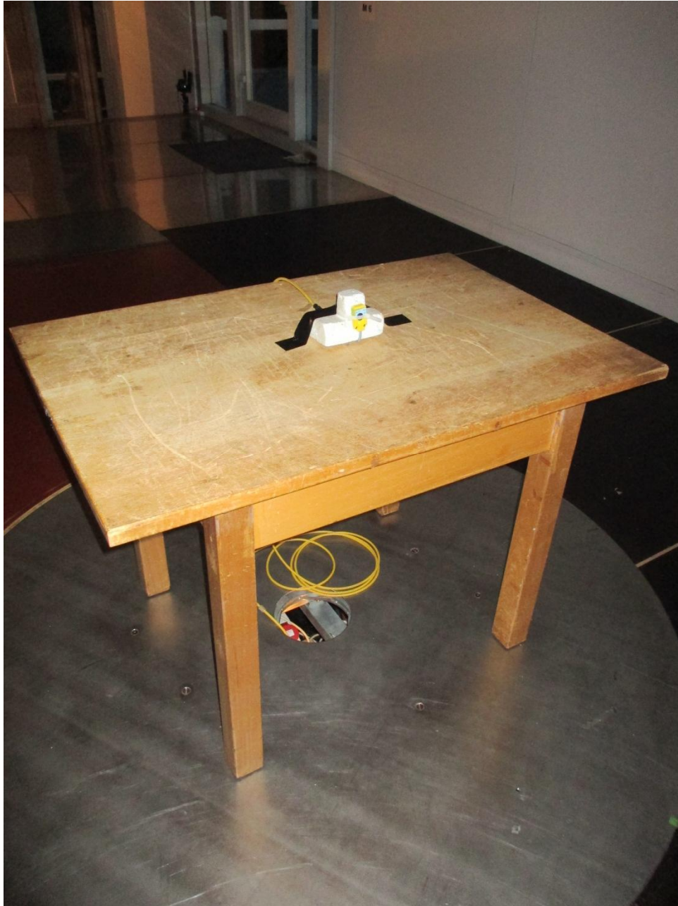
146168_4.JPG: Test setup open area test site