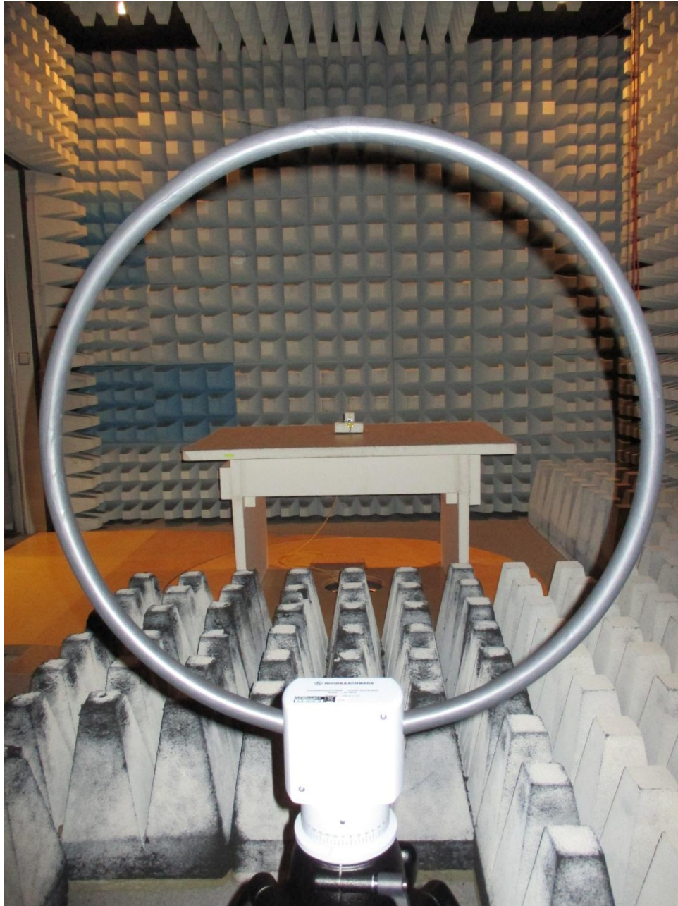
146168_3.JPG: Test setup fully anechoic chamber (H-Field)