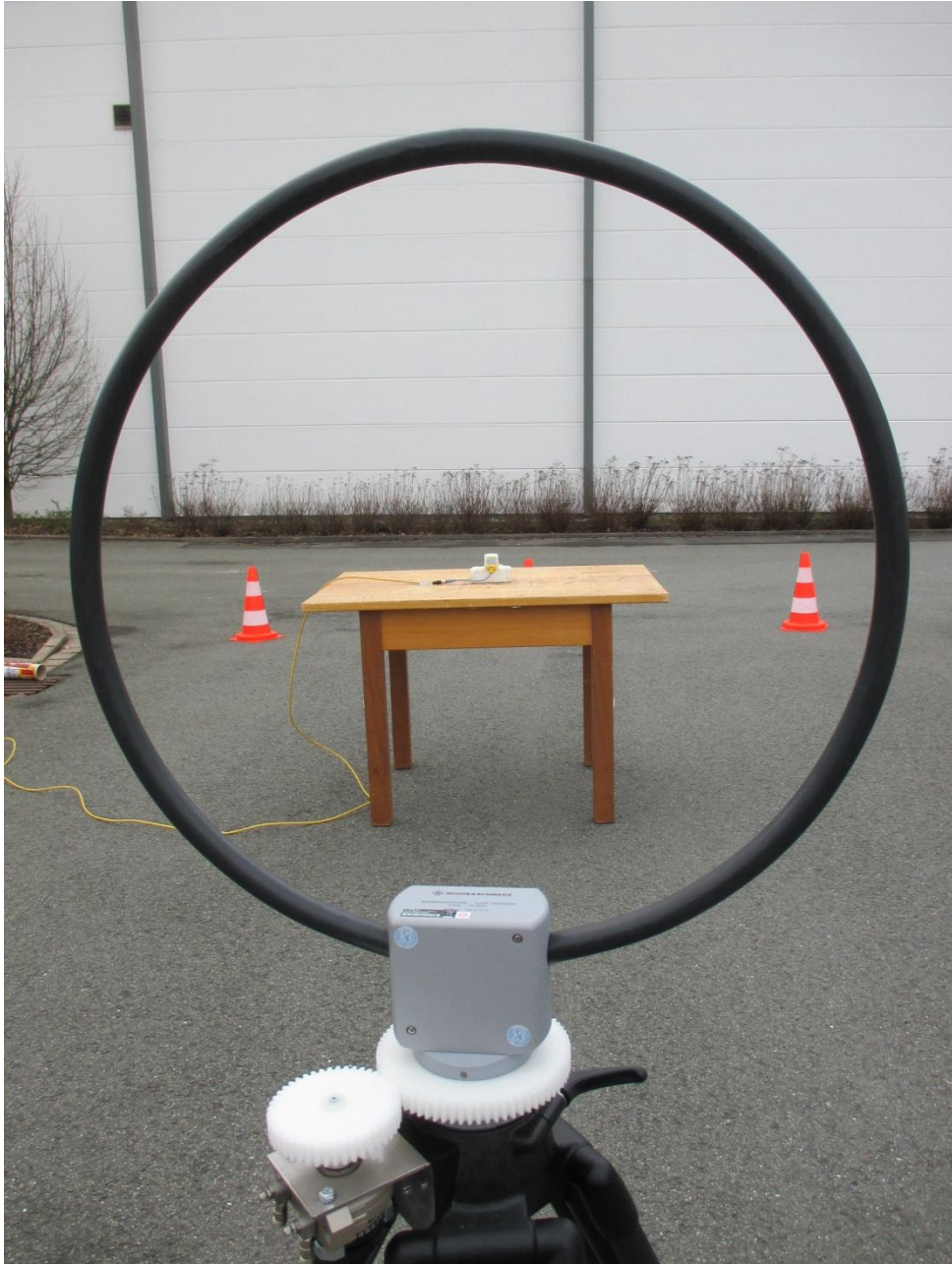
146168_5.JPG: Test setup outdoor test site