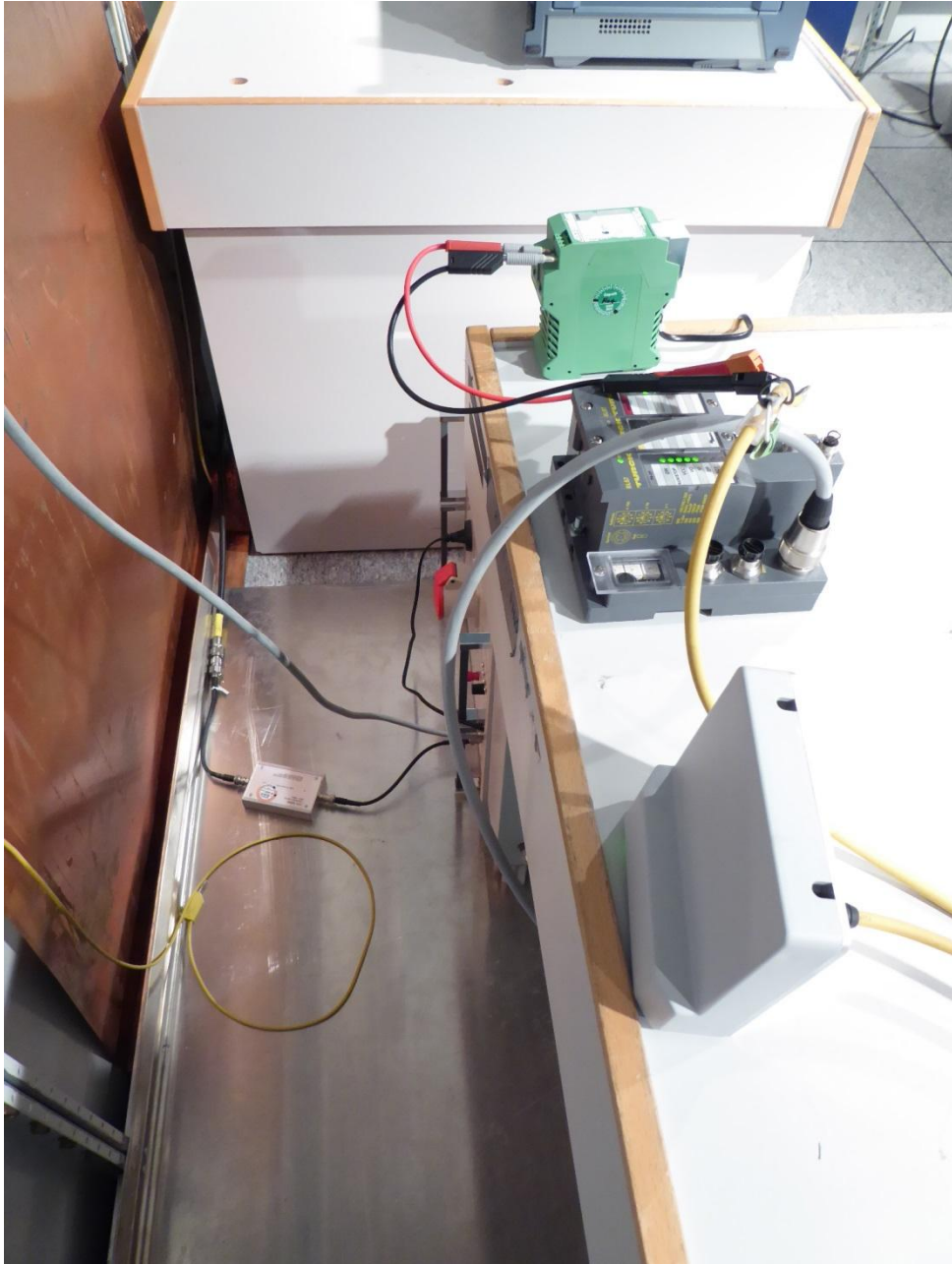
154999_1.JPG: Test setup shielded chamber