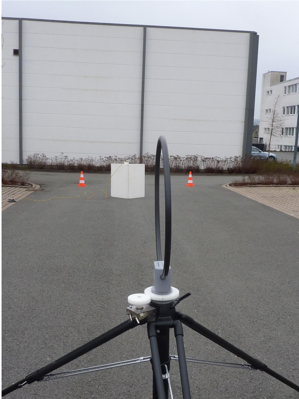
154999_5.JPG: Test setup outdoor test site