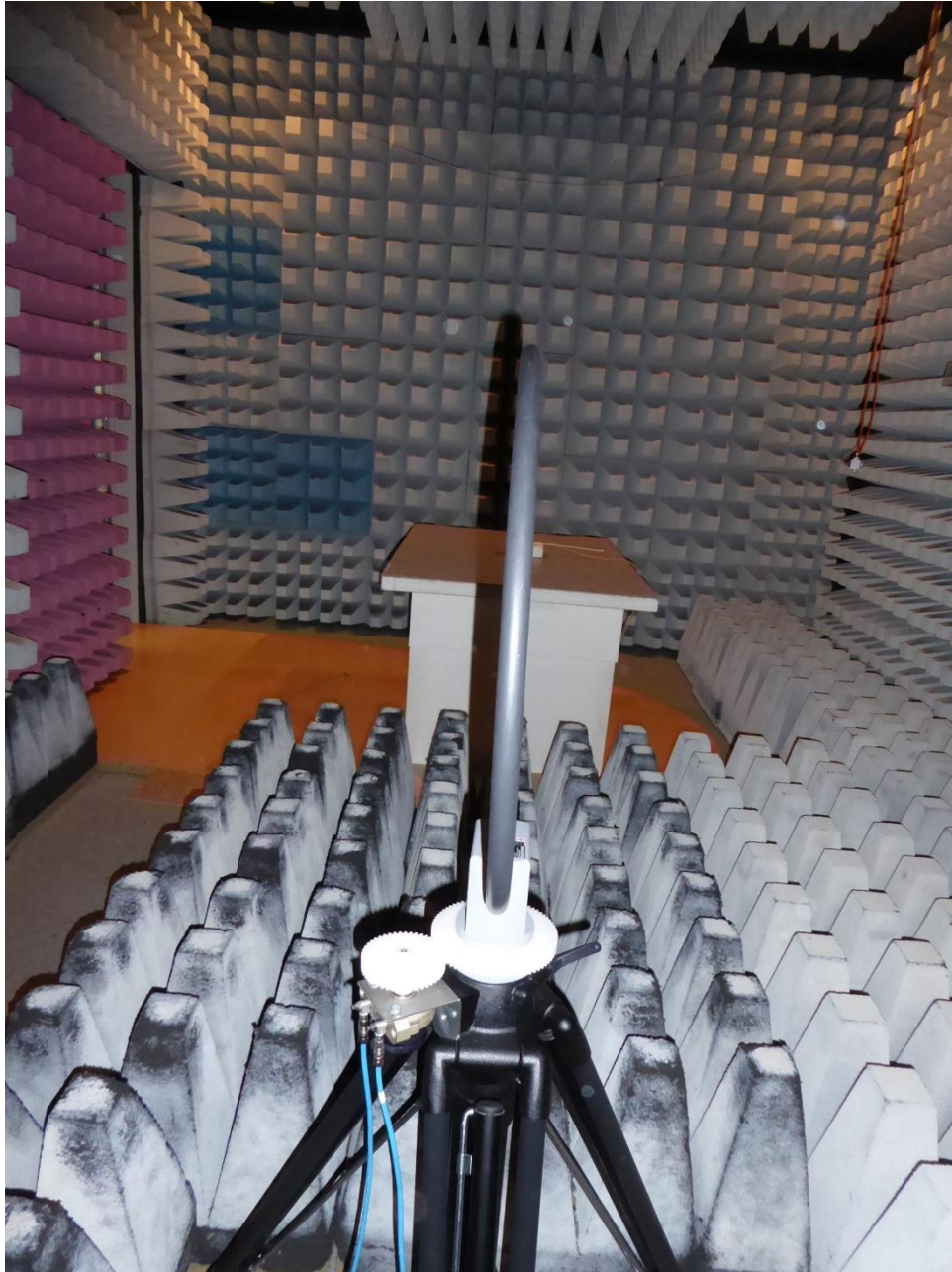
154999_3.JPG: Test setup fully anechoic chamber (H-Field)