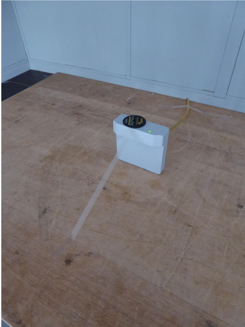
154999_4.JPG: Test setup open area test site