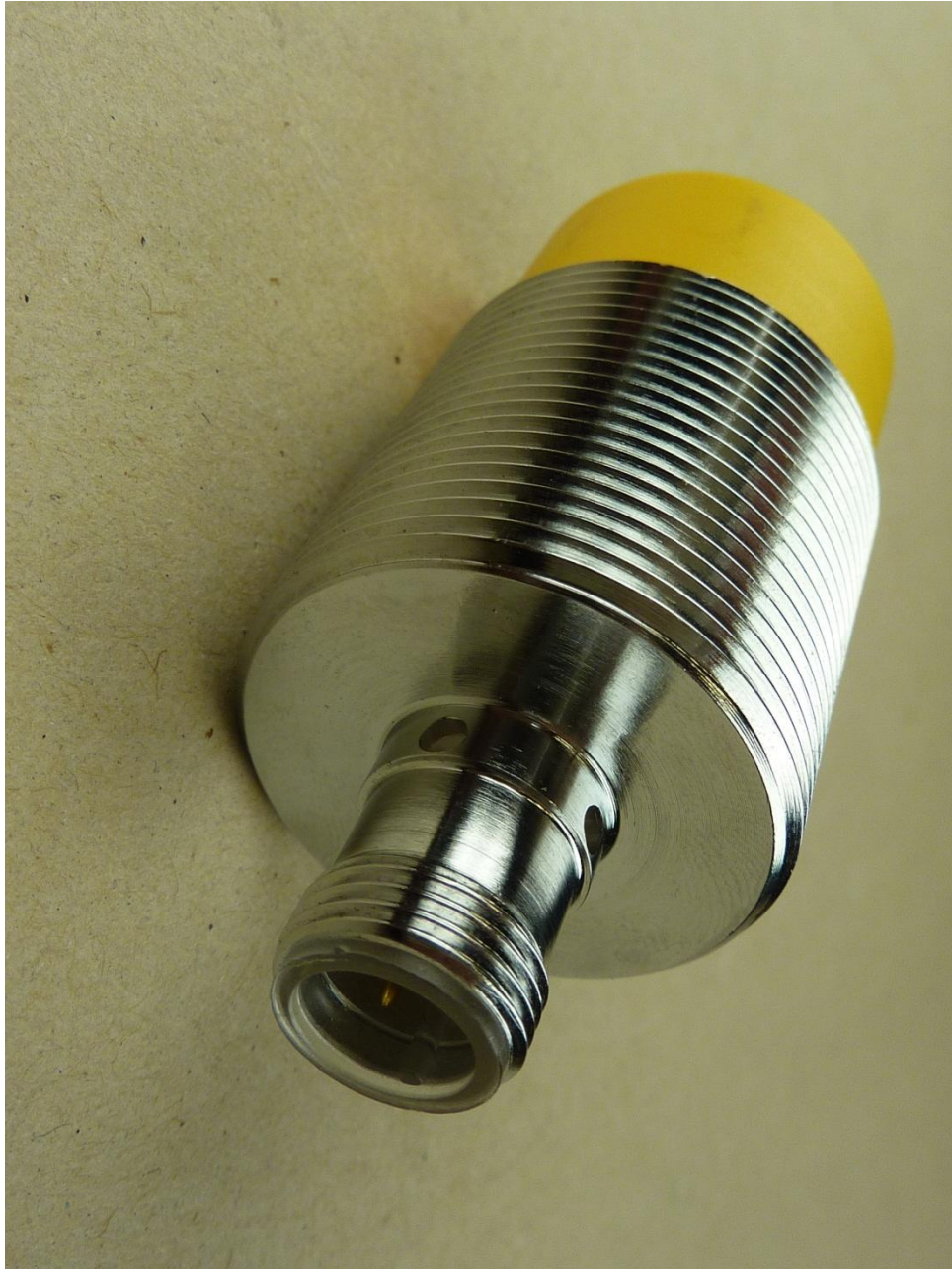
135060_8.JPG: TN-M30-H1147, 3D view 2