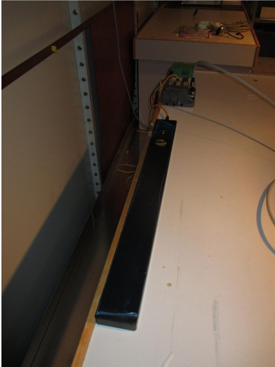
150253_1.JPG: Test setup shielded chamber