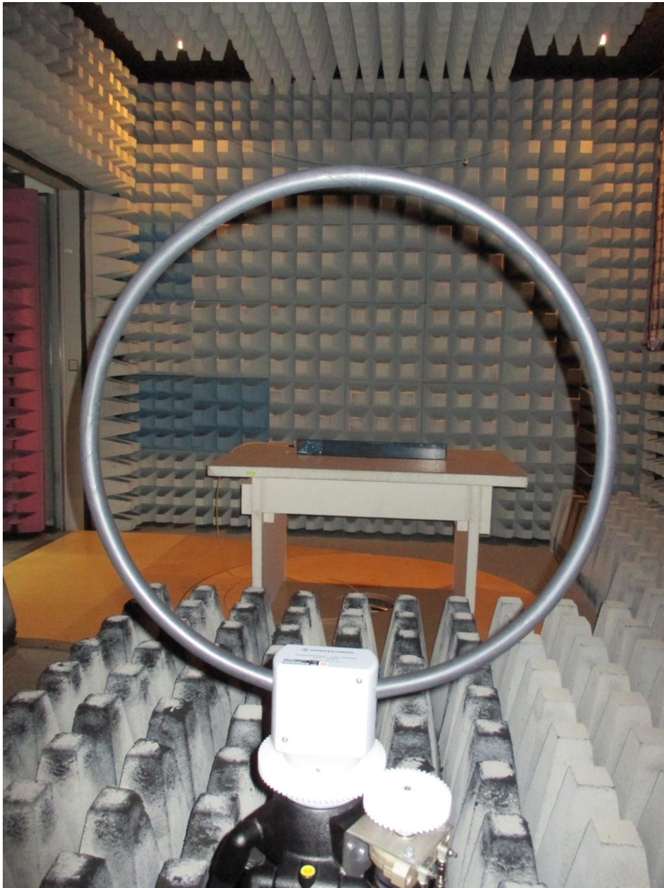
150253_3.JPG: Test setup fully anechoic chamber (H-Field)