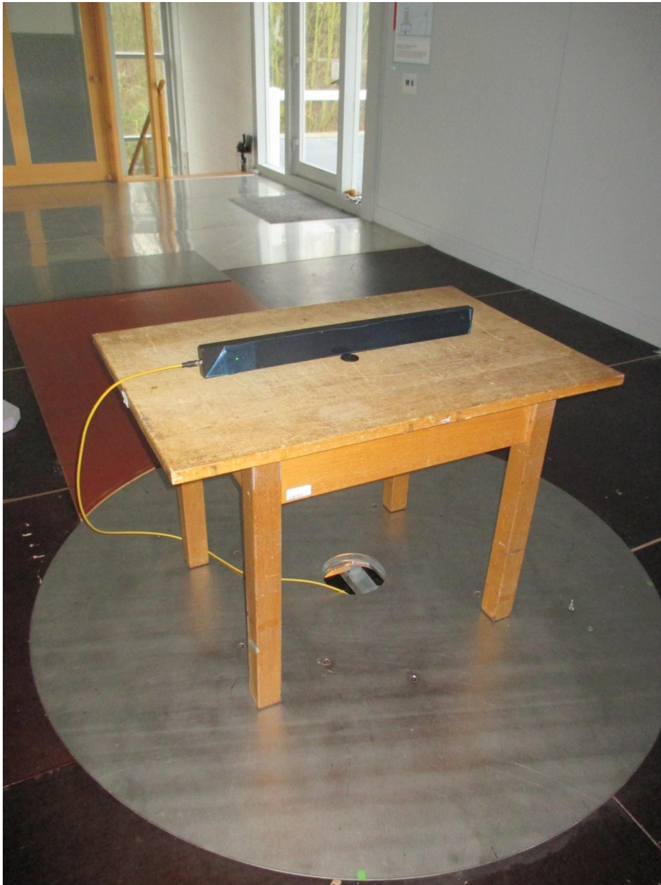
150253_4.JPG: Test setup open area test site