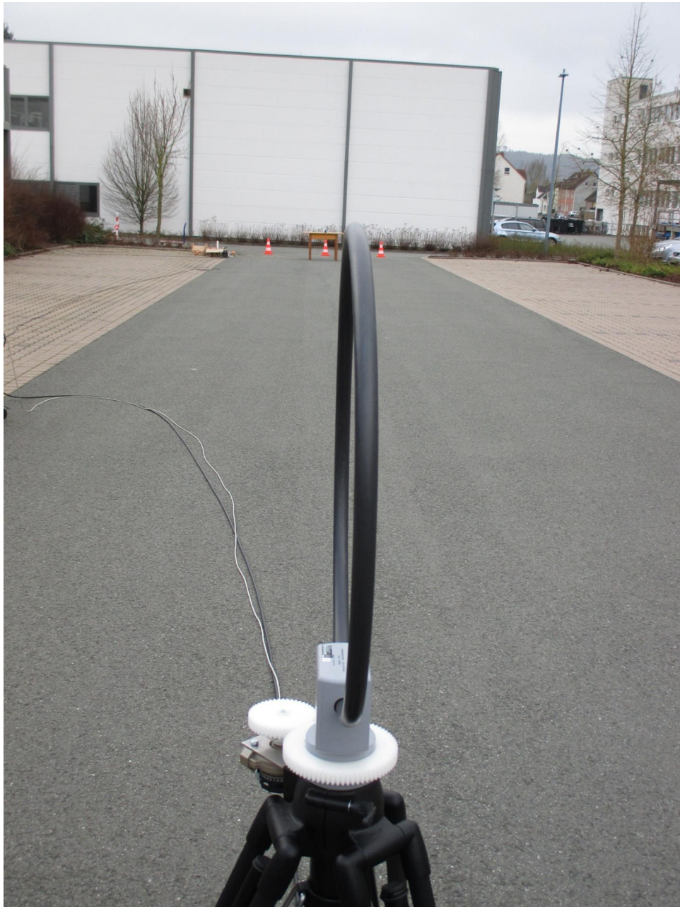
150253_5.JPG: Test setup outdoor test site