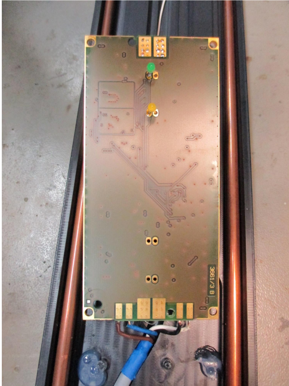
150253_10.JPG: TNLR-Q80L800-H1147, PCB, top view