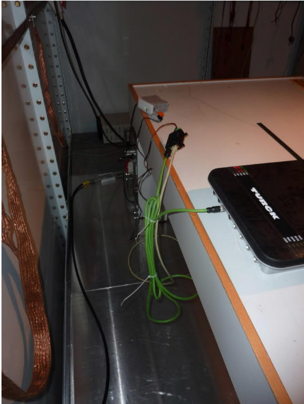
Test setup shielded chamber (EUT PoE supplied)