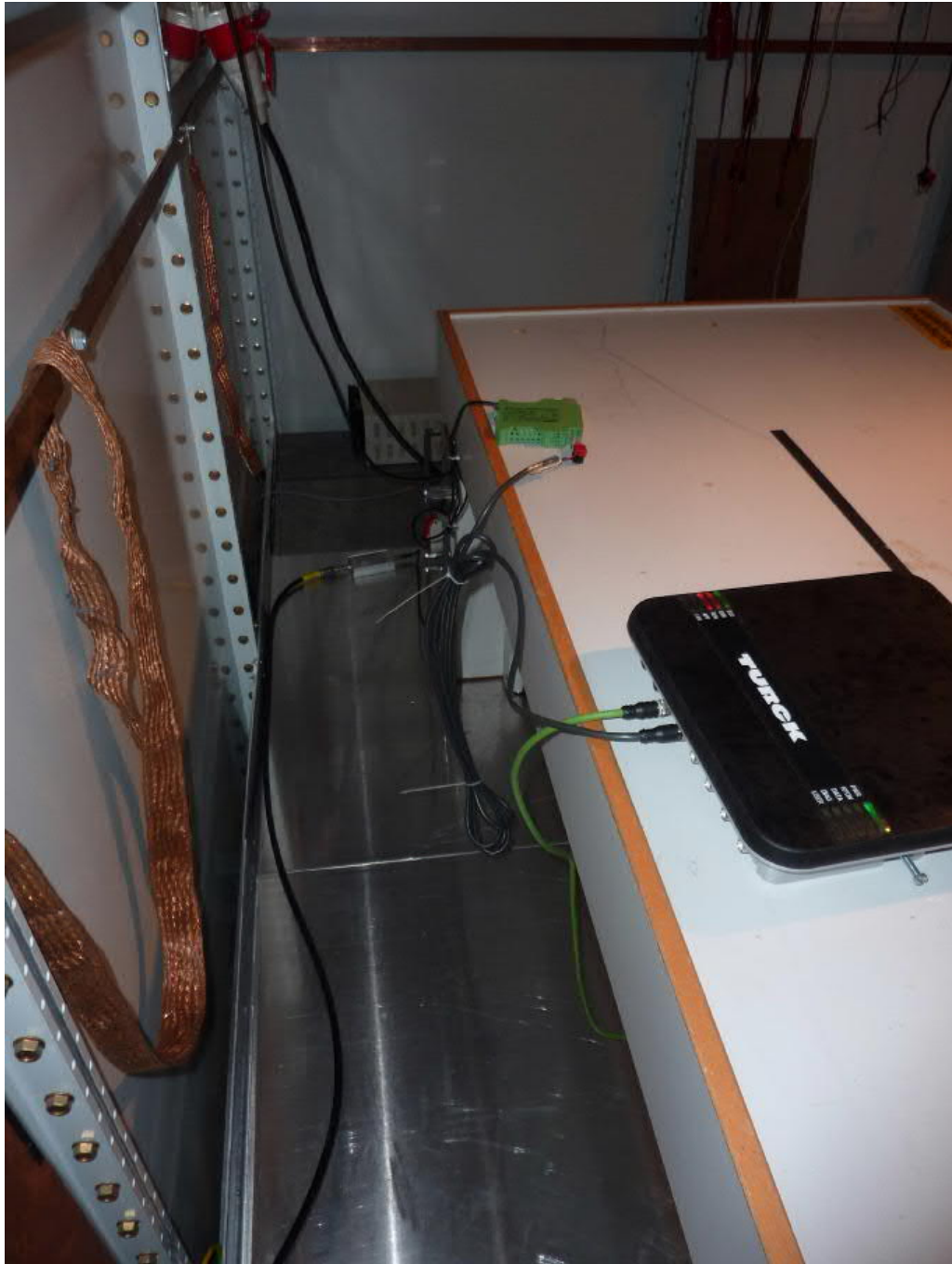
Test setup shielded chamber (EUT DC supplied)