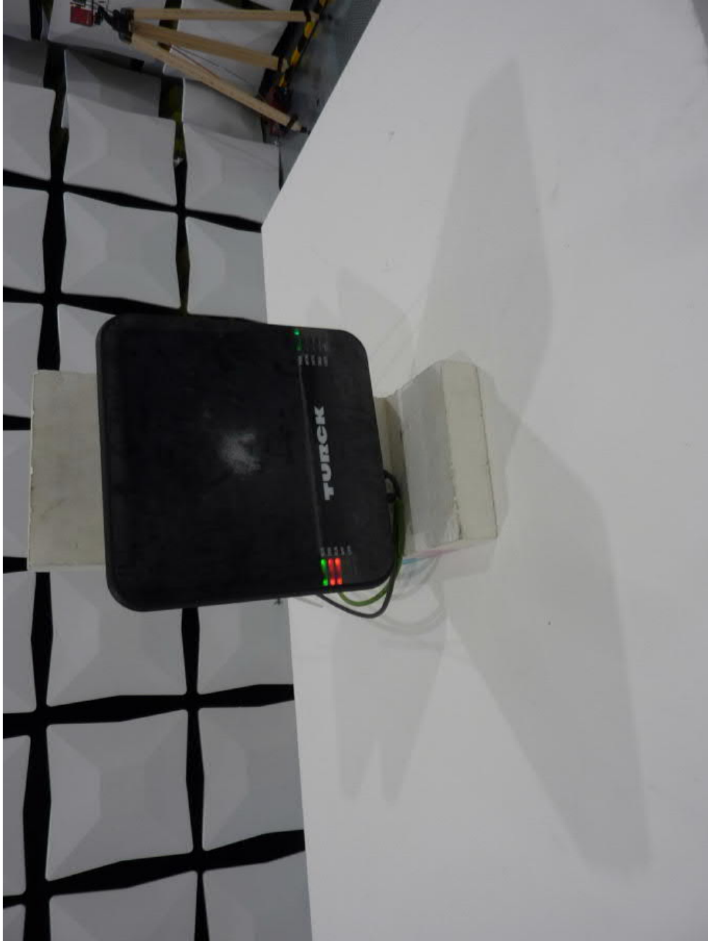
Test setup semi anechoic chamber