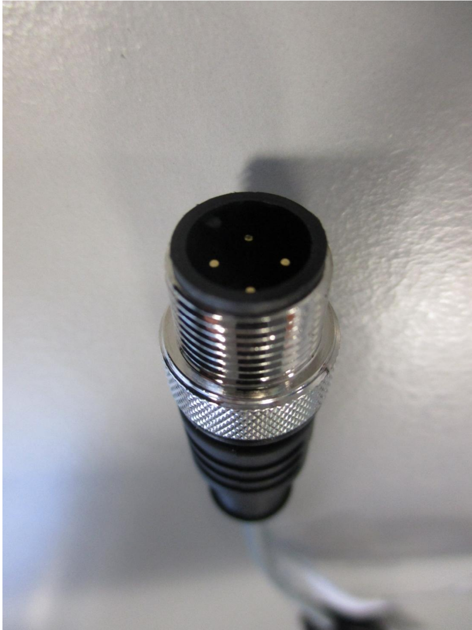
135053_9.JPG: TB-Q08-0.15-RS4.47T, S2500 plug