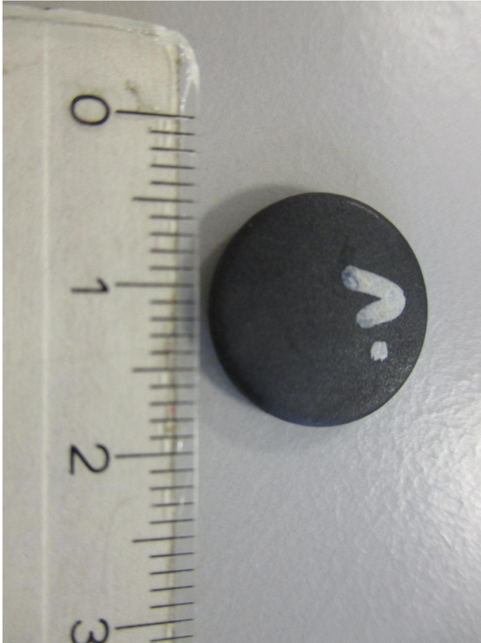
135053_10.JPG: RFID tag