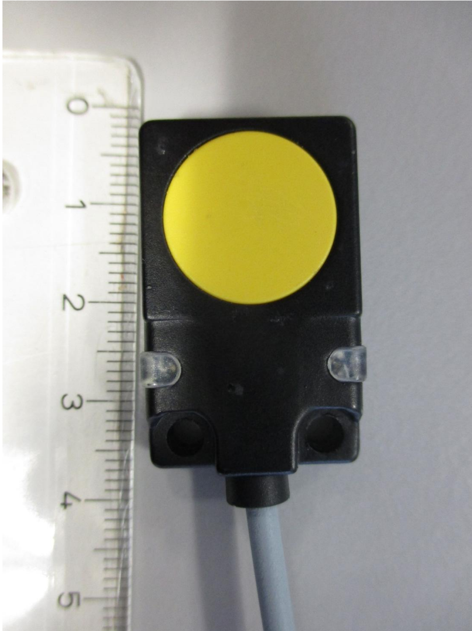
135053_6.JPG: TB-Q08-0.15-RS4.47T, top view