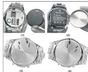
step to install the battery: from photo(1) to photo(4). step to uninstall the battery: from photo(4) to photo(1)