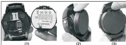
step to install the battery: from photo(1) to photo(3). step to uninstall the battery: from photo(3) to photo(1)