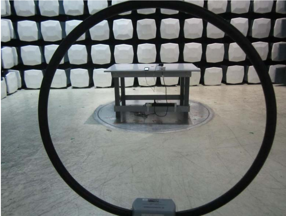
Conducted Emission (AC Mains)