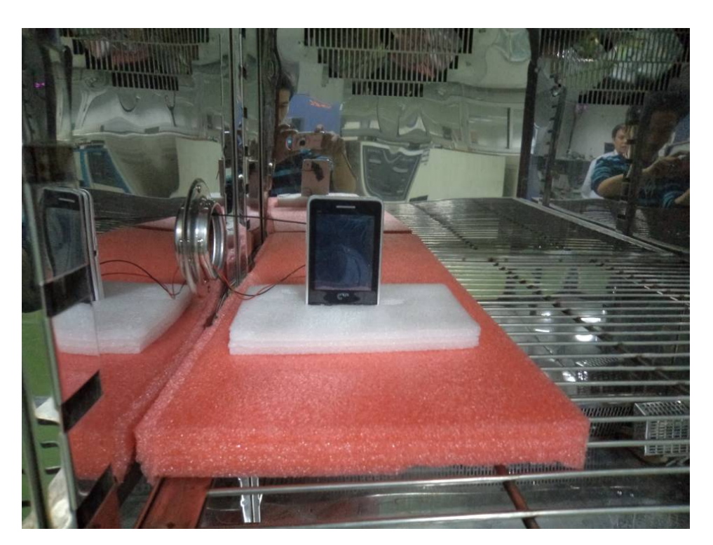
Frequency Stability Test View