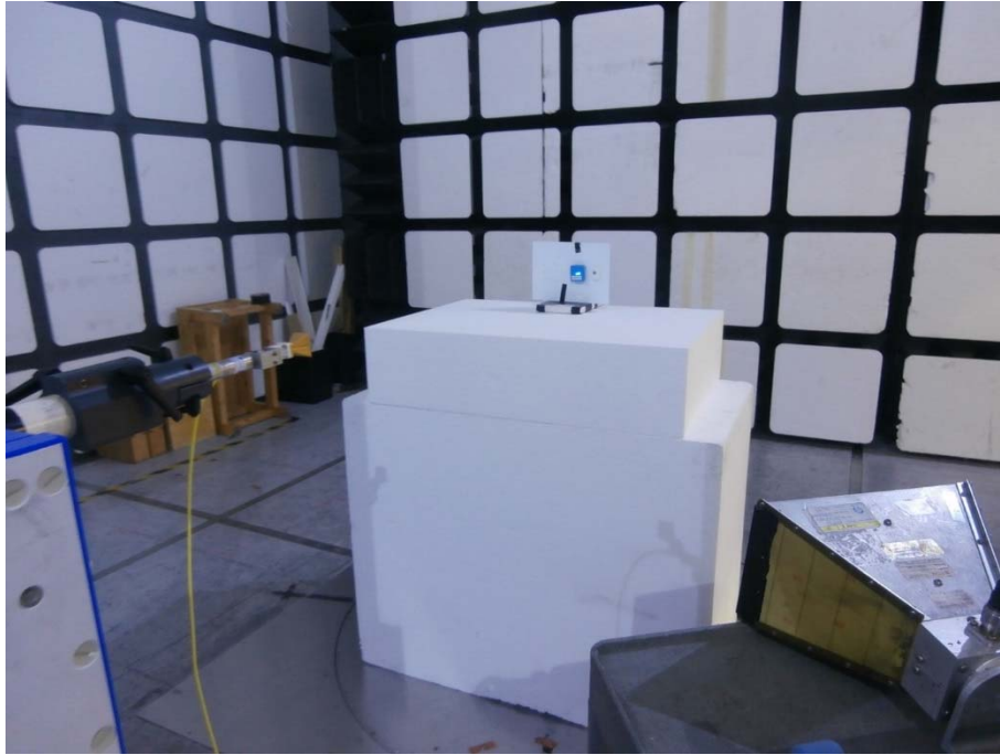
Radiated Emissions 18 GHz to 25 GHz