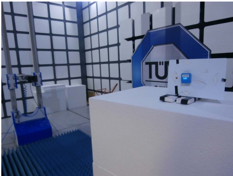
Radiated Emissions 1 GHz to 8 GHz