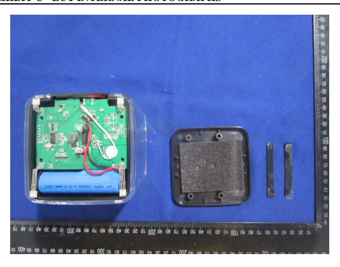
EXHIBIT C - EUT INTERNAL PHOTOGRAPHS