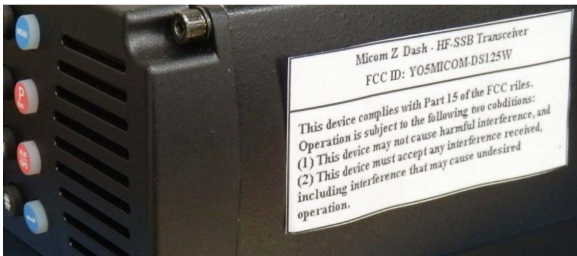
The label is located on the side of the device

This device complies with Part 15 of the FCC rules. Operation is subject to the following two conditions: (1) This device may not cause harmful interference, and (2) This device must accept any interference received, including interference that may cause undesired operation.