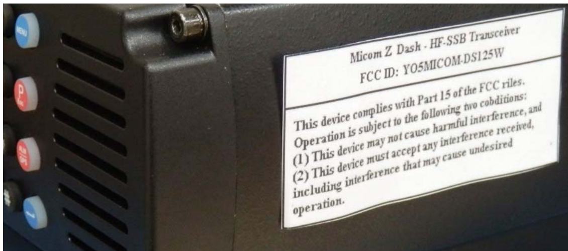
The label is located on the side of the device

This device complies with Part 15 of the FCC rules. Operation is subject to the following two conditions: (1) This device may not cause harmful interference, and (2) This device must accept any interference received, including interference that may cause undesired operation.