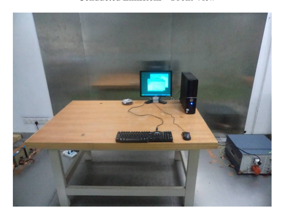
Conducted Emissions – Side View