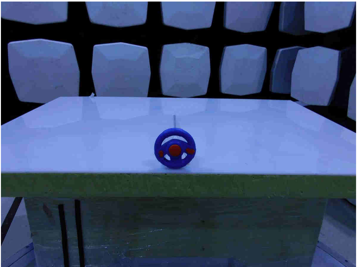
Up to 1GHz (The EUT placed at the center of the turntable)