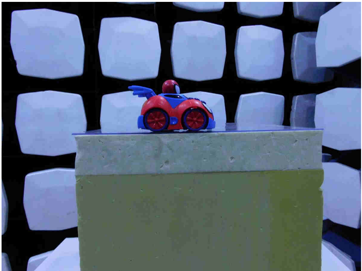
Above 1GHz (The EUT placed at the center of the turntable)