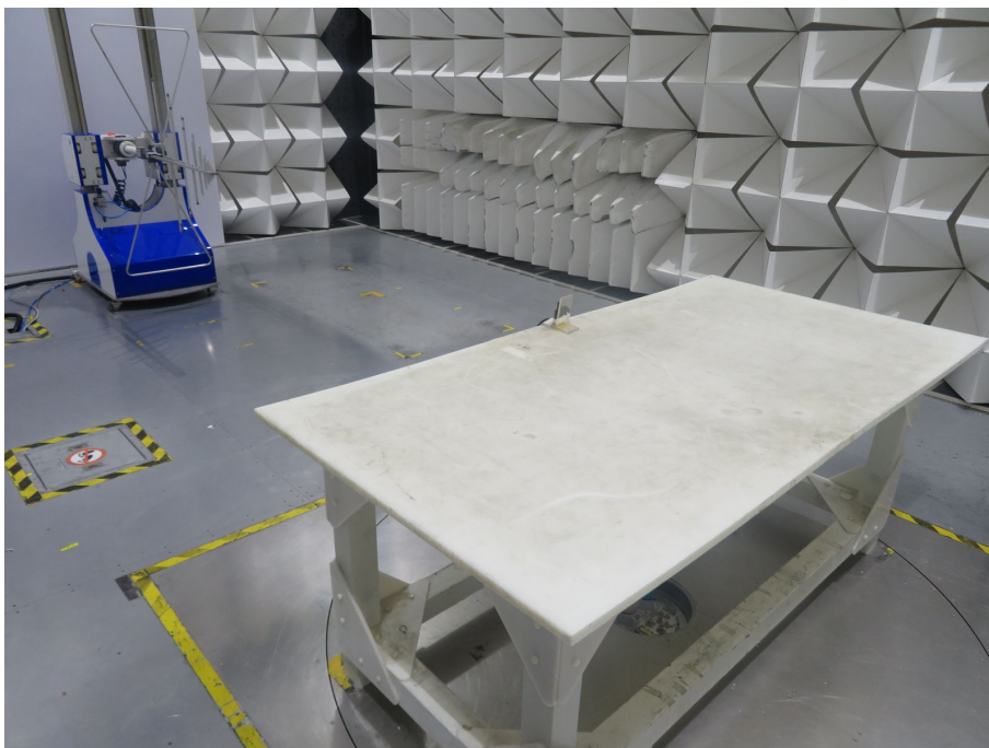
Radiated spurious emission Test Setup-2 (30MHz~1GHz)