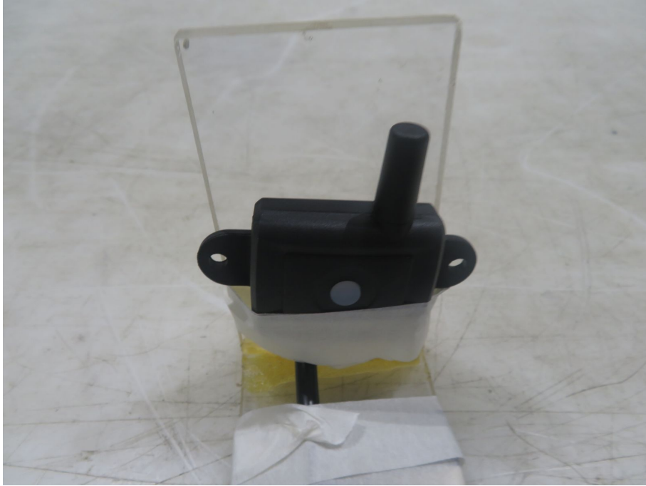
Radiated spurious emission close-up (30MHz~1GHz)