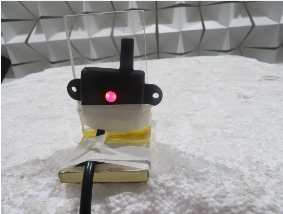
Radiated spurious emission close-up(Above 1GHz)