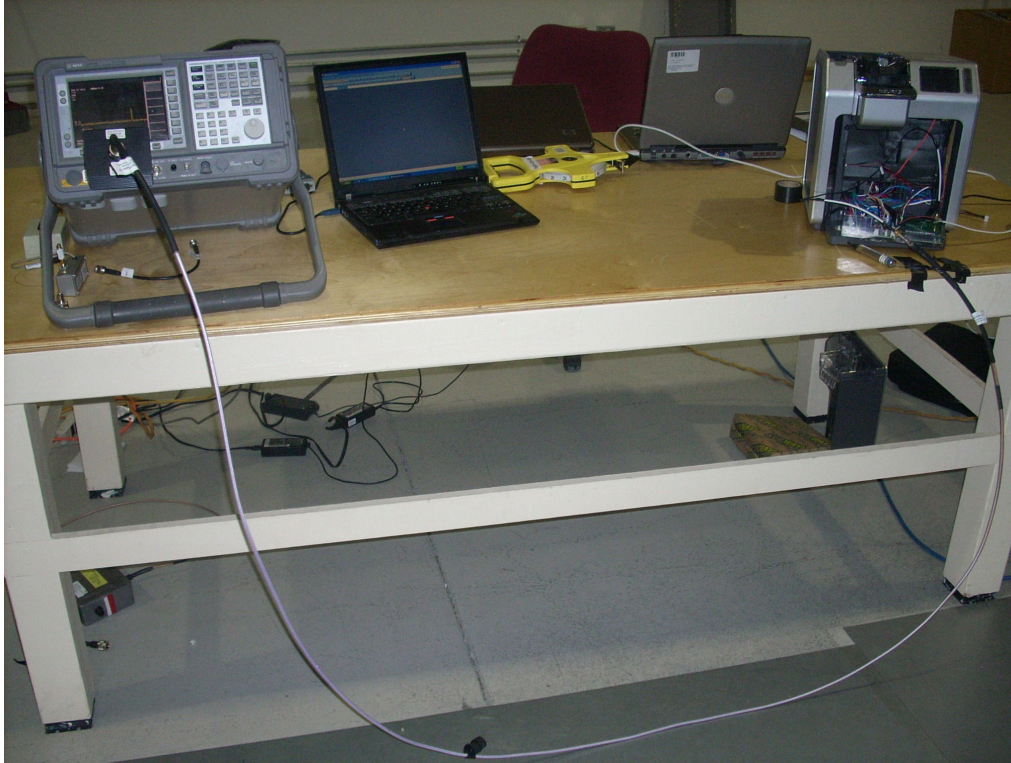
Antenna Port Conductive Measurements