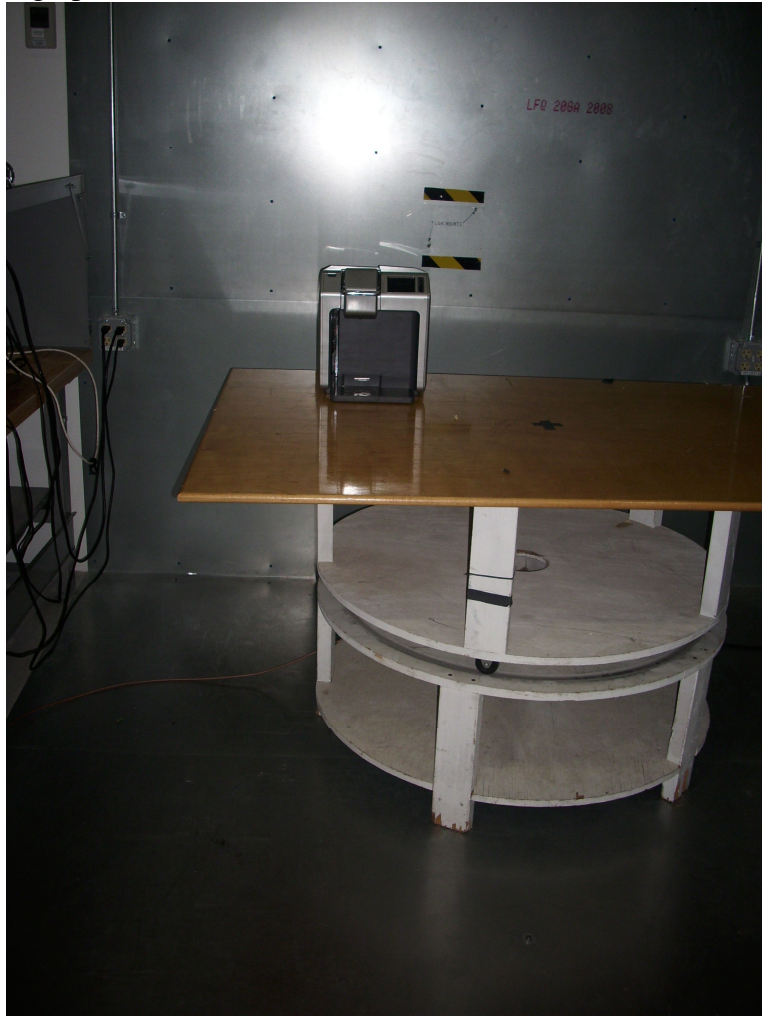
AC Line Conducted Emissions - Front