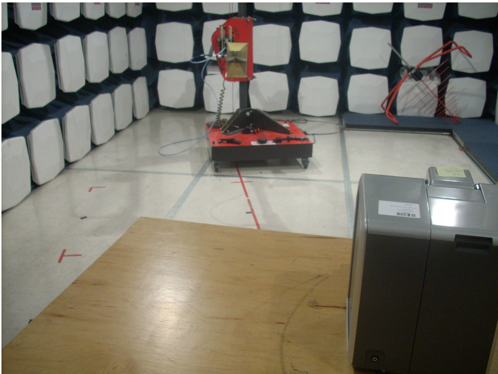
Radiated Spurious Emissions Above 1GHz in Anechoic Chamber