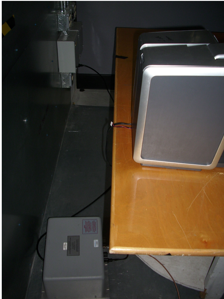
AC Line Conducted Emissions - Rear