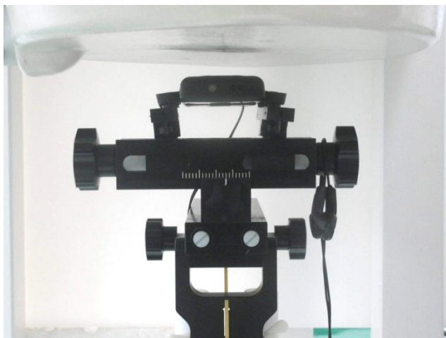
Bottom of the DUT with Phantom 1.5 cm Gap