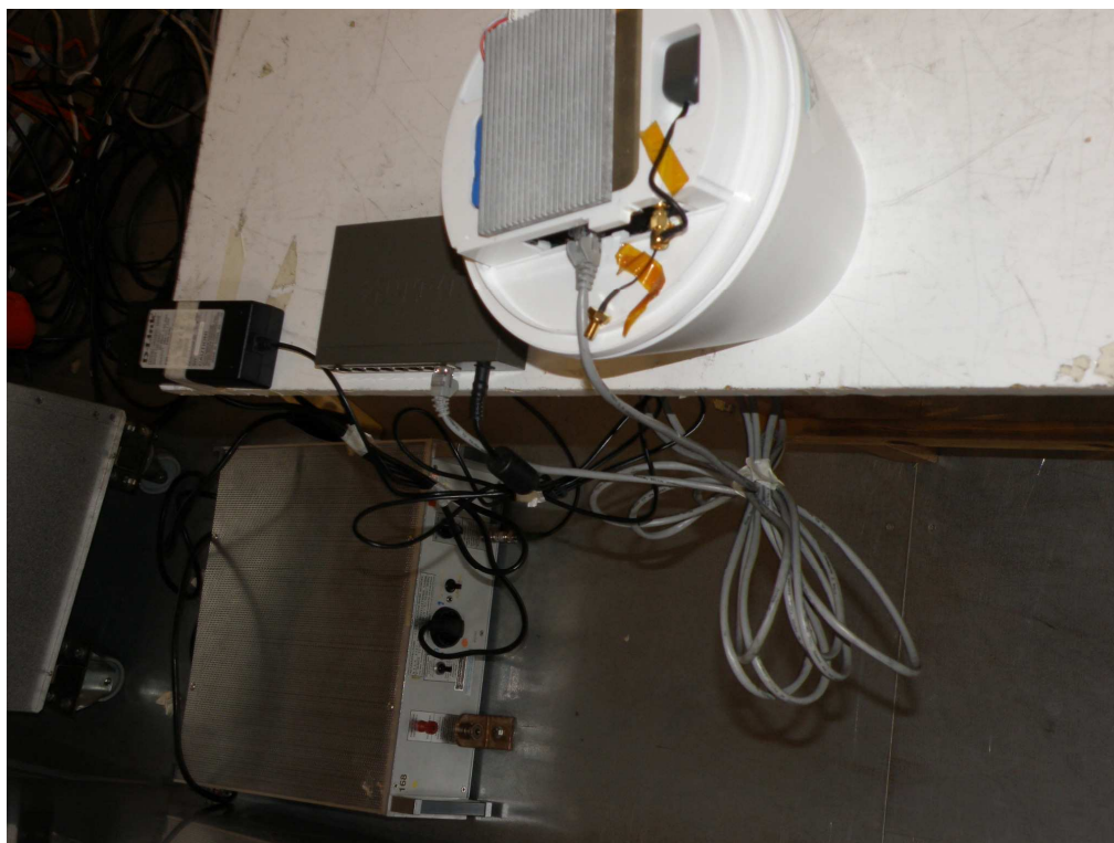
Photograph 1. Conducted emissions at AC power port