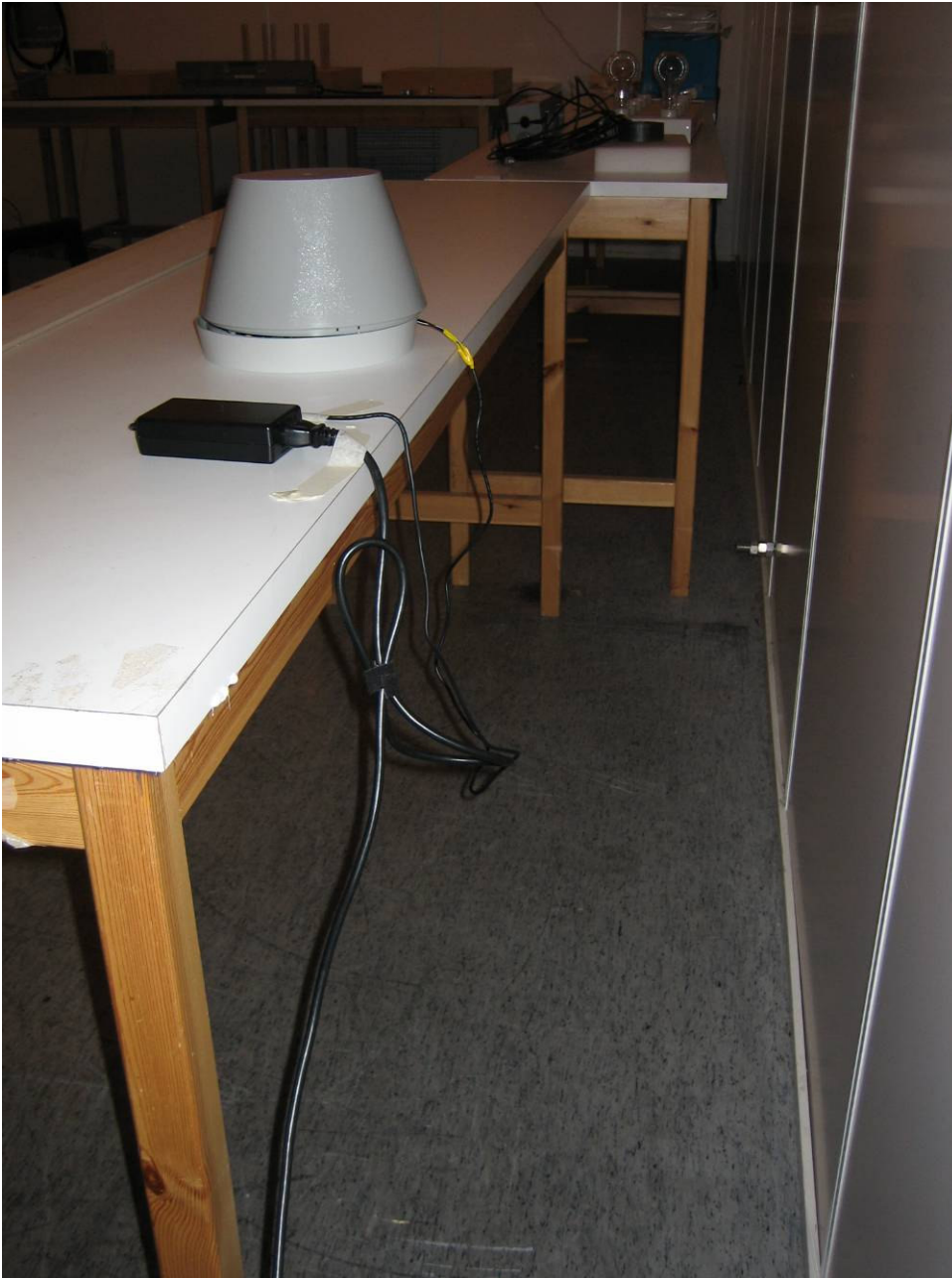
Conducted emission test setup.