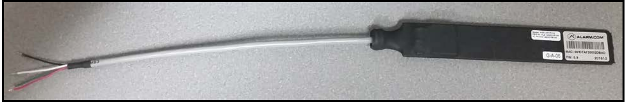
Photograph 13: ADC-XCVR100 Module

Client: Alarm.com Model/HVIN: ADC-XCVR100 Standards: FCC 15.247/IC RSS-247 ID's: YL6-143XCVR100/9111A-143XCVR100 Report #: 2016188