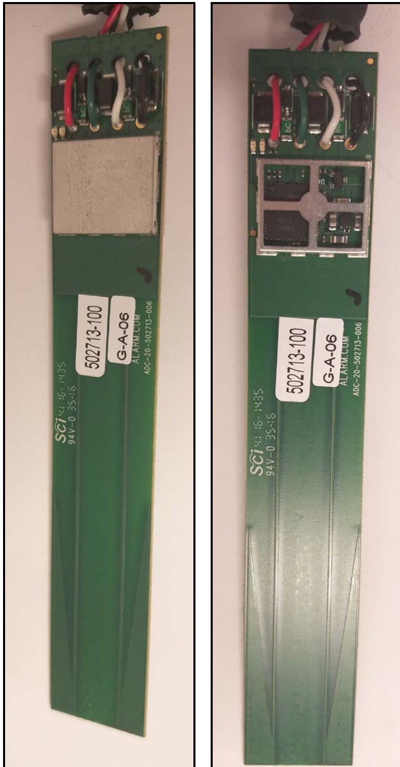
Photograph 11: Top View with Shield and Top View without Shield