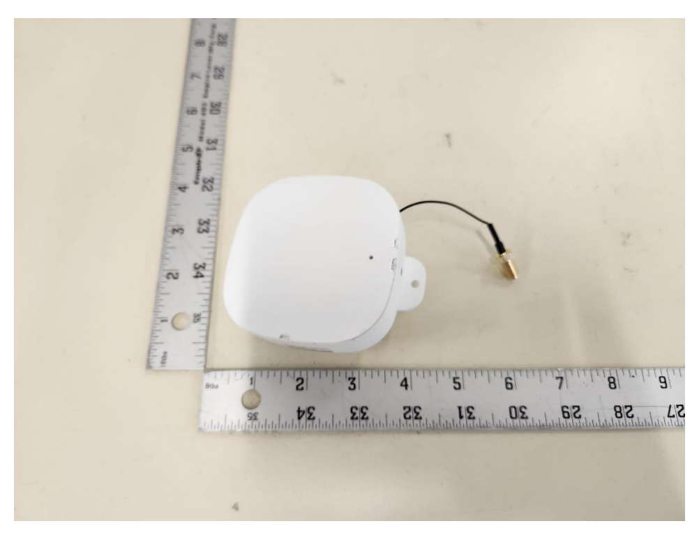
Figure B4. Front view of the Conducted DUT