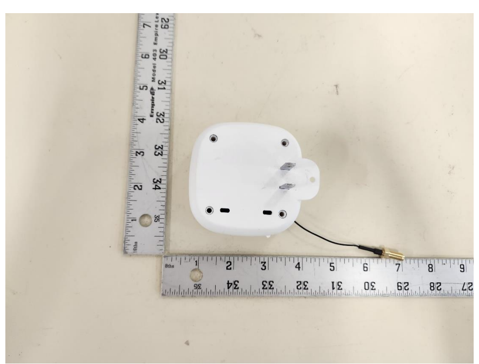
Figure B5. Rear view of the Conducted DUT