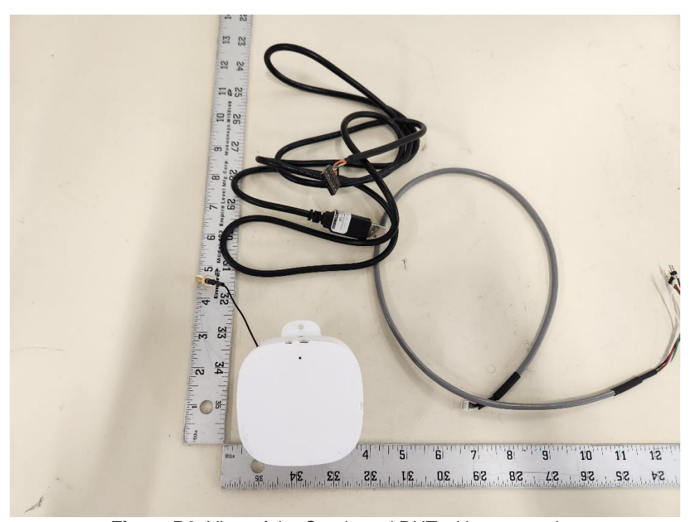
Figure B6. View of the Conducted DUT with accessories