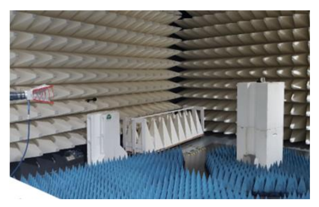
Figure B8. Radiated Setup 2