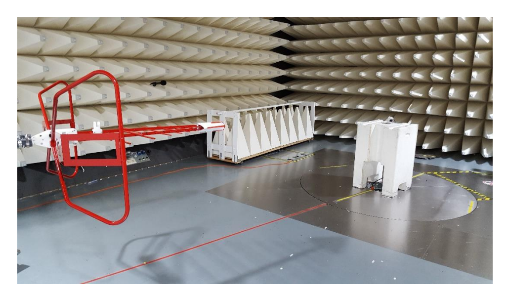
Figure B7. Radiated Setup 1